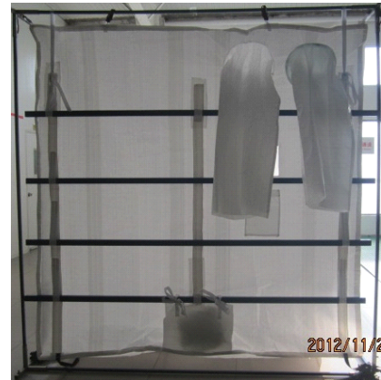
PE Woven Bulk Liner

Dry bulk container liners, also known as shipping, sea bulk or sea land container liners. These liners are made from PE film or PE woven material depending on material specification required by customer. They are used in standard, bulk and open top containers. The most common sizes are for standard 20, 30 and 40 foot export containers. However it can be designed to any size according to the customer's requirement.