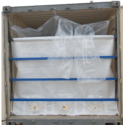
PE Film Bulk Liner