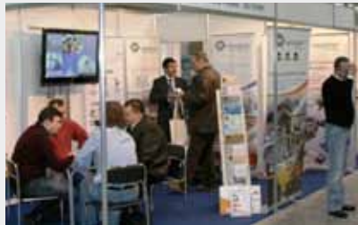
Sectors represented at SyMas 2010