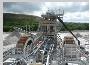
Dry Mining Plant

Following this the group then visited the drying and processing plants before going on to the Port to view the Rail Unloading System and Ship loading facilities. The Ship loading originally took place at Par Docks but has now been moved to Fowey docks. Fowey is now the sole point of departure for all Imerys' clay. The clay arrives at the water's edge by pipeline in slurry form, rail or along Imerys' private road that was once the track bed of the railway linking the two harbours.