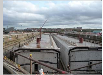
New Submersible sections for the Tunnel

brief visit to the new Tyne Tunnel which is being constructed as an Immersed tunnel. At the casting yard we viewed the immersed tunnel units which will form the river crossing element of the works. The main contractor for the scheme is Bouygues Travaux Publics and the immersed units are being subcontracted to Volker Stevin which is an Anglo-Dutch team onsite.