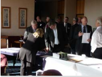
Busy time at the reception desk !

This first event attracted 50 members who came and saw presentations from RWE Npower and E.ON. In addition two MHEA members companies gave presentations on their products and services. The audience was also updated on what's happening in MHEA, both from the Executive committee and on the Strategic review which we are currently undertaking.