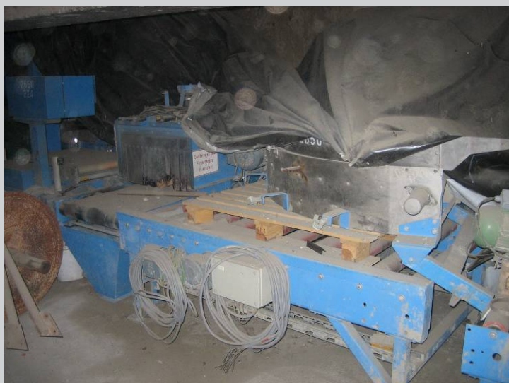
Picture: 1 Sack discharge