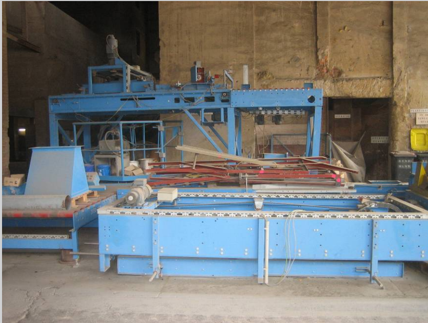
Picture: 4 Rotopacker arrangement