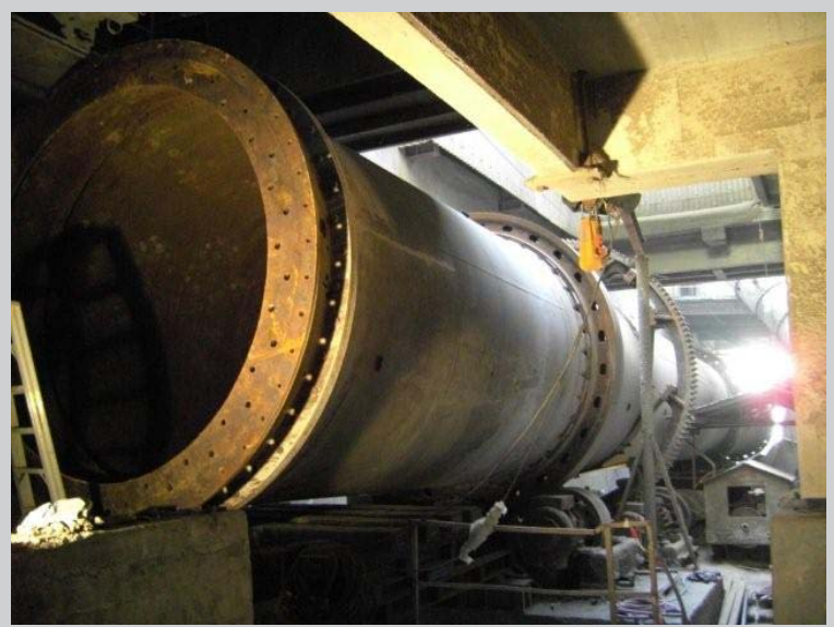
View on kiln drive system