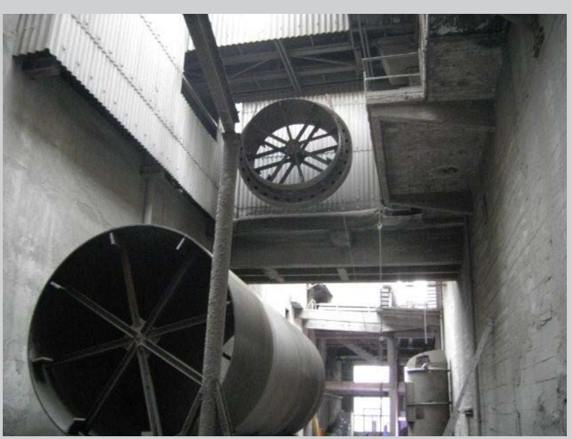
Disassembly kiln slide shoe