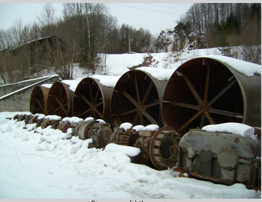
Storage of kiln parts