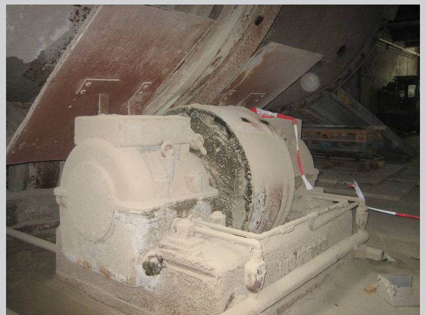
Roller station 3