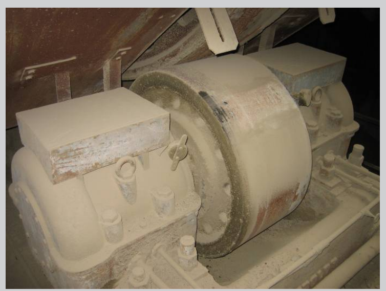
Roller station 1