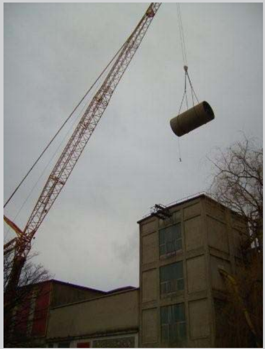
Lifting kiln shell out of the building