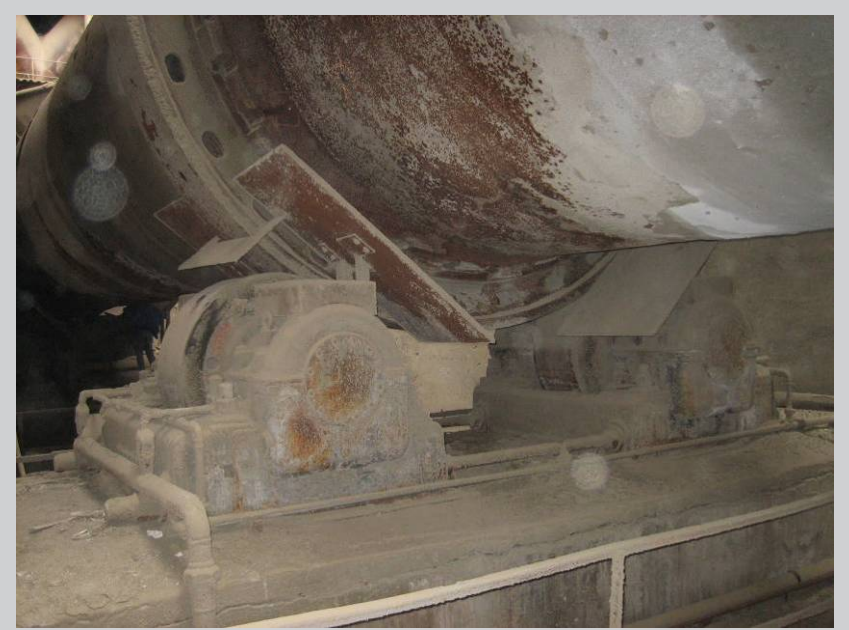
Roller station 3