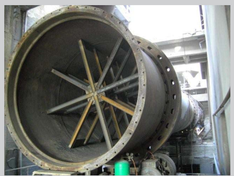
View on kiln outlet