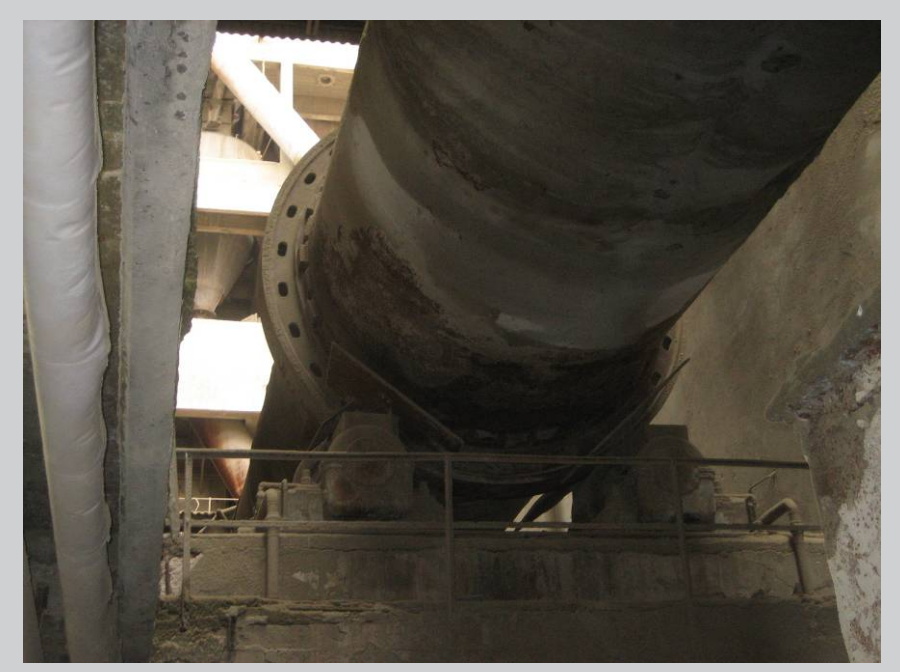
View on roller station 2