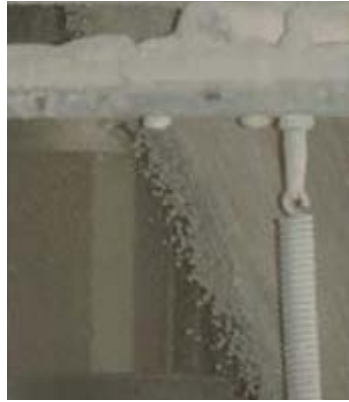
Dust generation by direct feed from conveyor belt. Particle break-away at the edge of the feed causes high volumes of dust.