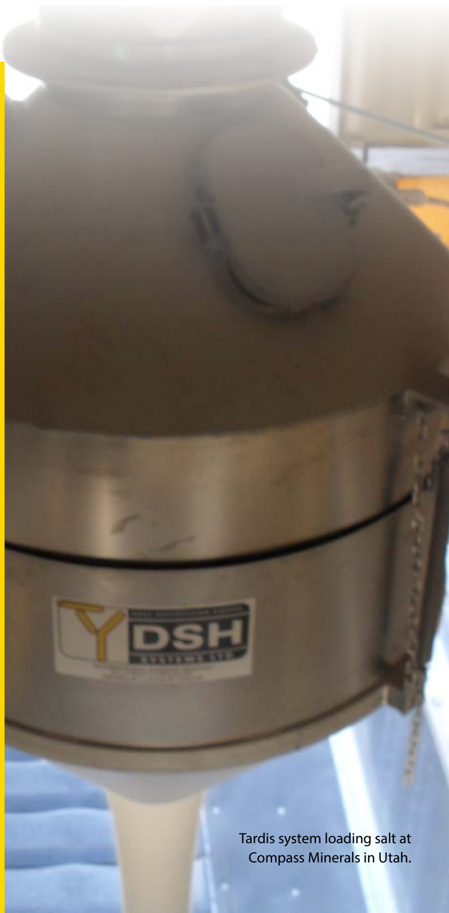
Tardis system loading salt at Compass Minerals in Utah.

If your site does not fit our standard products, we will endeavor to engineer a solution that works for your application.