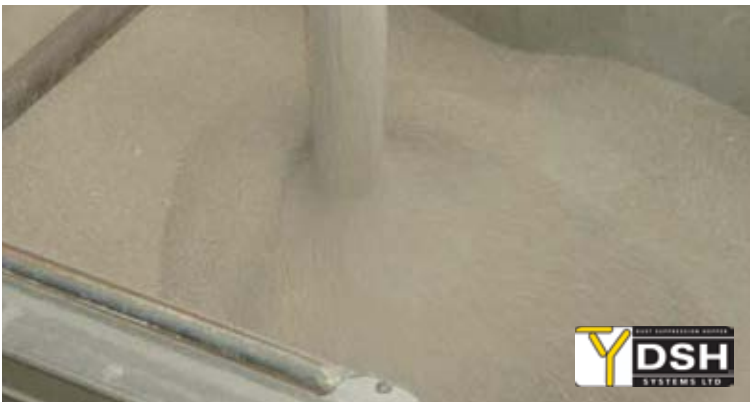
With DSH systems, there is no dust generation on impact. Radial flow occurs away from the impact point.