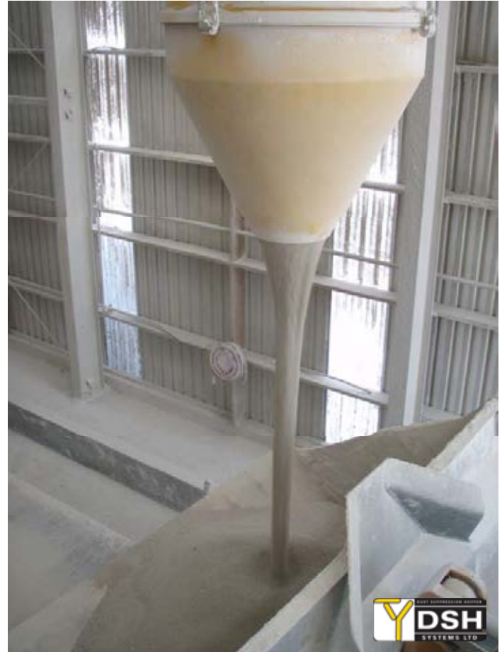
Converging powder stream rapidly thins. No dust emission from falling jet occurs.