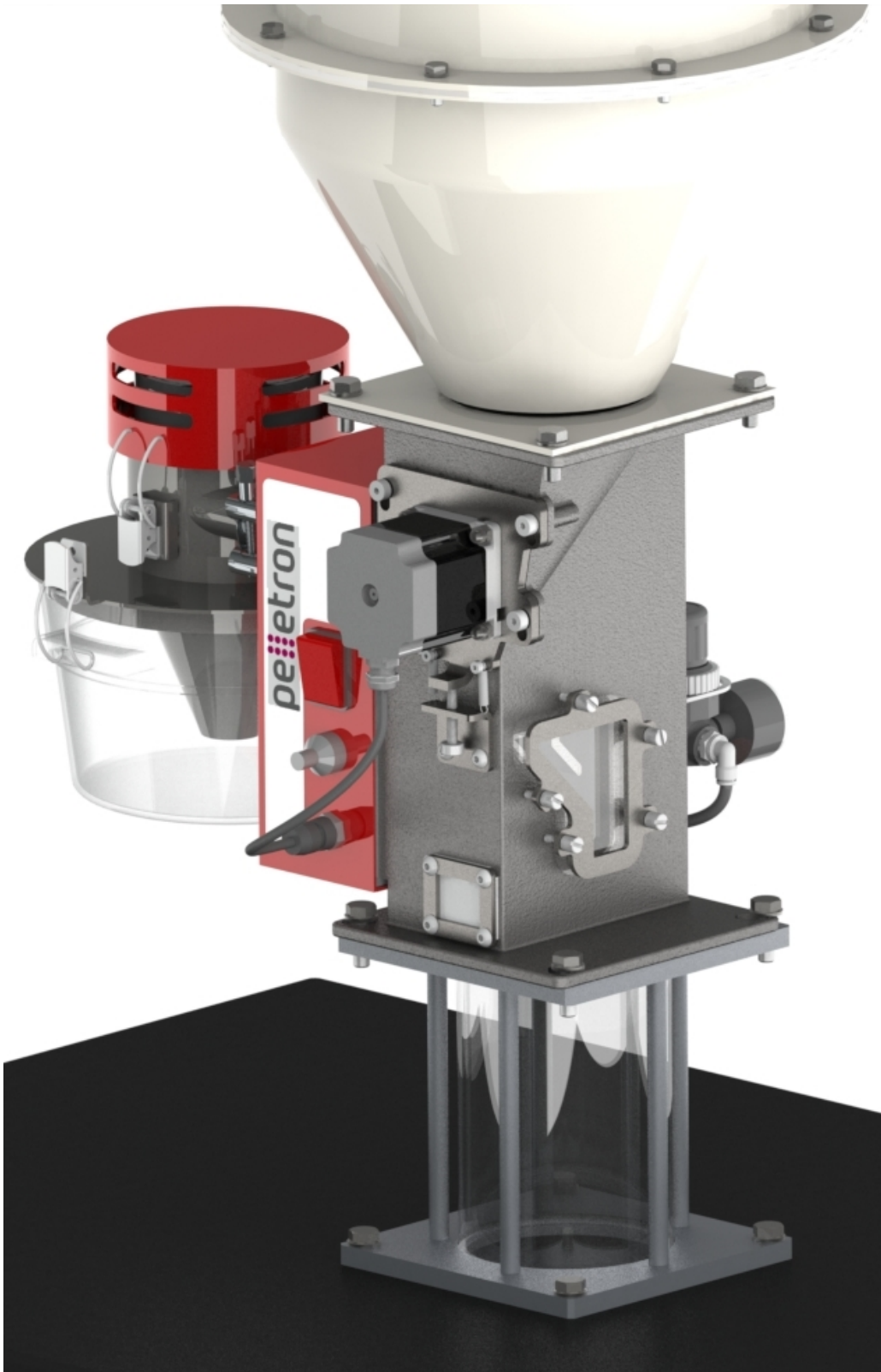
The lightweight C-20 DeDuster®