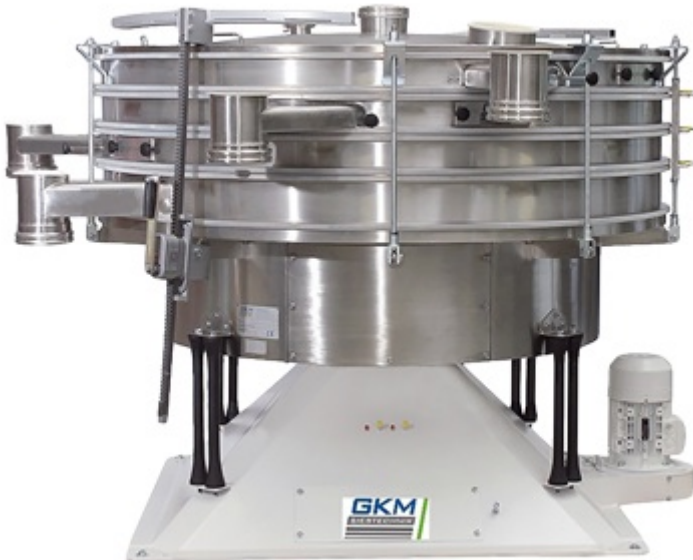
GKM Flat Deck Screener

Edited by on 29. Jun. 2017 Bristol (PA), United States -