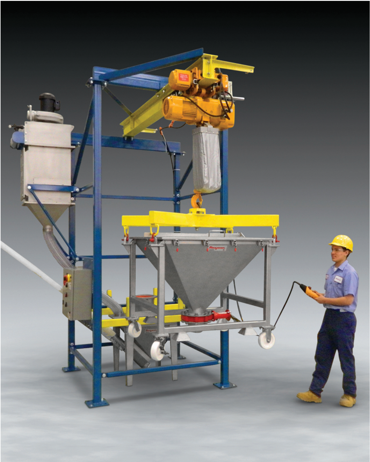
Flexicon's IBC Discharger raises and positions rigid Intermediate Bulk Containers without the use of a forklift, makes a dust-tight connection to a surge hopper available with outlets to charge a flexible screw conveyor (shown), tubular cable conveyor or