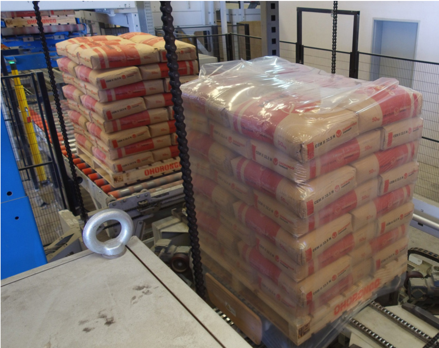
Picture 7: Roller conveyors transfer the palletised bags to the BEUMER stretch hood A.

But there was something to consider regarding the packaging: "Unlike transportation in Germany, in Africa the material may need to travel by truck not only a few hundred kilometres, but often up to a thousand kilometres," Mr. Pirker says. In addition, high temperatures soften the material of the film. Pirker explains: "We use film of 80 and 100 micrometers in thickness in order to obtain the required transportation safety."