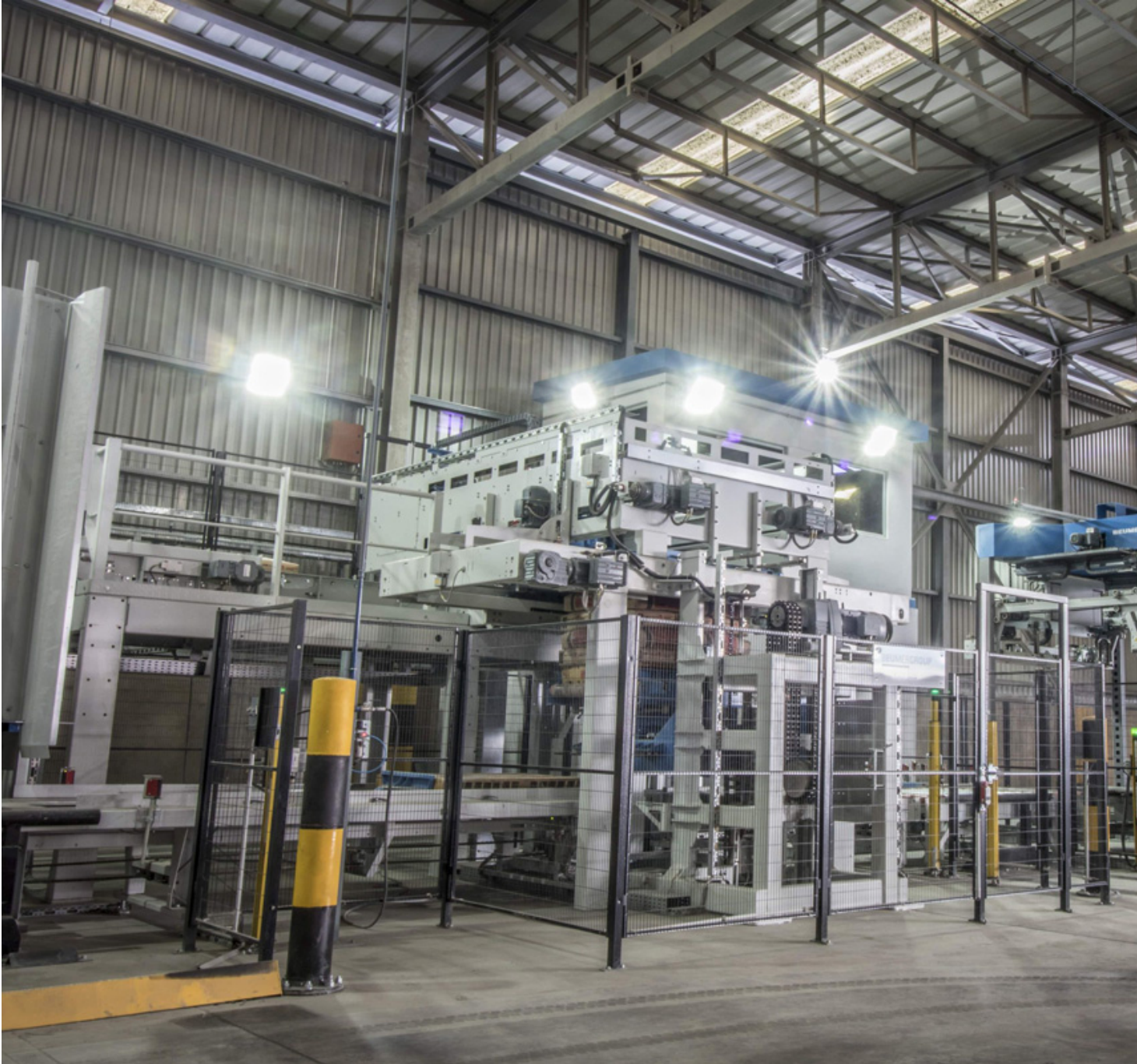
Picture 6: The BEUMER paletpac stacks the 50 kilogram bags in 5-bag-patterns onto the pallets in an exact and gentle manner.

processes. " The system component moves the bags without deforming them from a mechanical viewpoint. Two parallel belt conveyors are used instead. They turn the bags by moving at different speed. They also move the bags into the required position very gently . The intelligent control of the twin-belt turning device takes into account the dimensions and weights of the bags in order to achieve an exact positioning preset by the respective packing pattern.