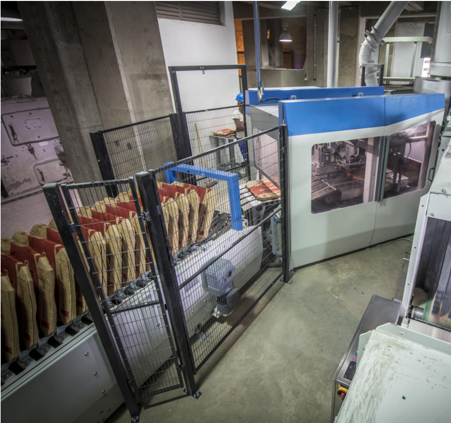
Picture 4: The BEUMER bag placer with Bundle magazine increases the efficiency of the filling system.

The impeller filling system is characterised by its speed and maximum material throughput. BEUMER Group also included a BEUMER bag placer with bundle magazine of the latest technology to further increase the efficiency of the filling system. Servomotors drive the application unit and the suction gripper automatically, precisely and with high levels of energy efficiency. The gripping system and the application unit apply the bag from the bag bundle safely onto the filling spout. 2,400 bags per hour can be applied like this with high precision.