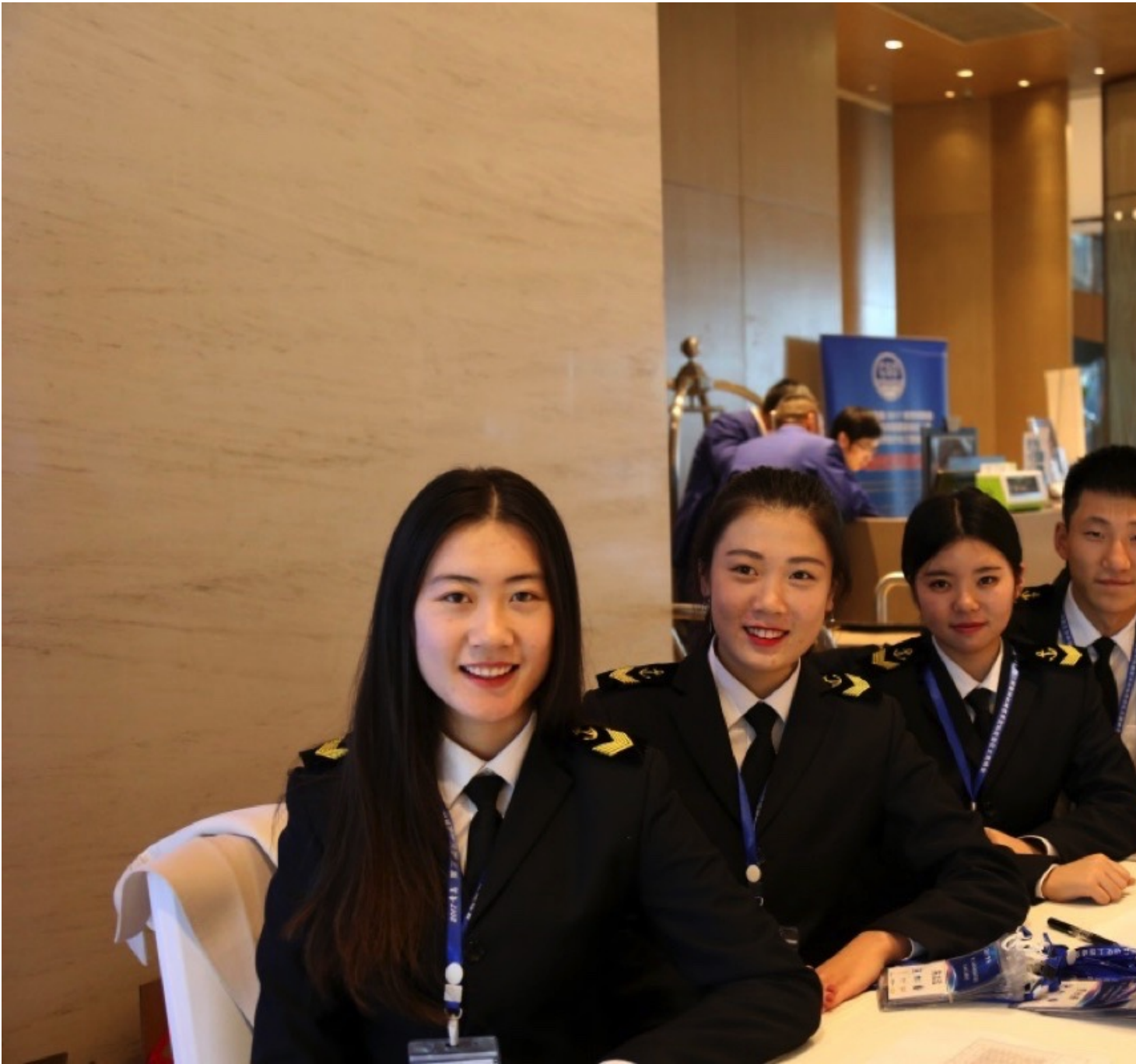
Impressions of the conference reception table: the reception team.