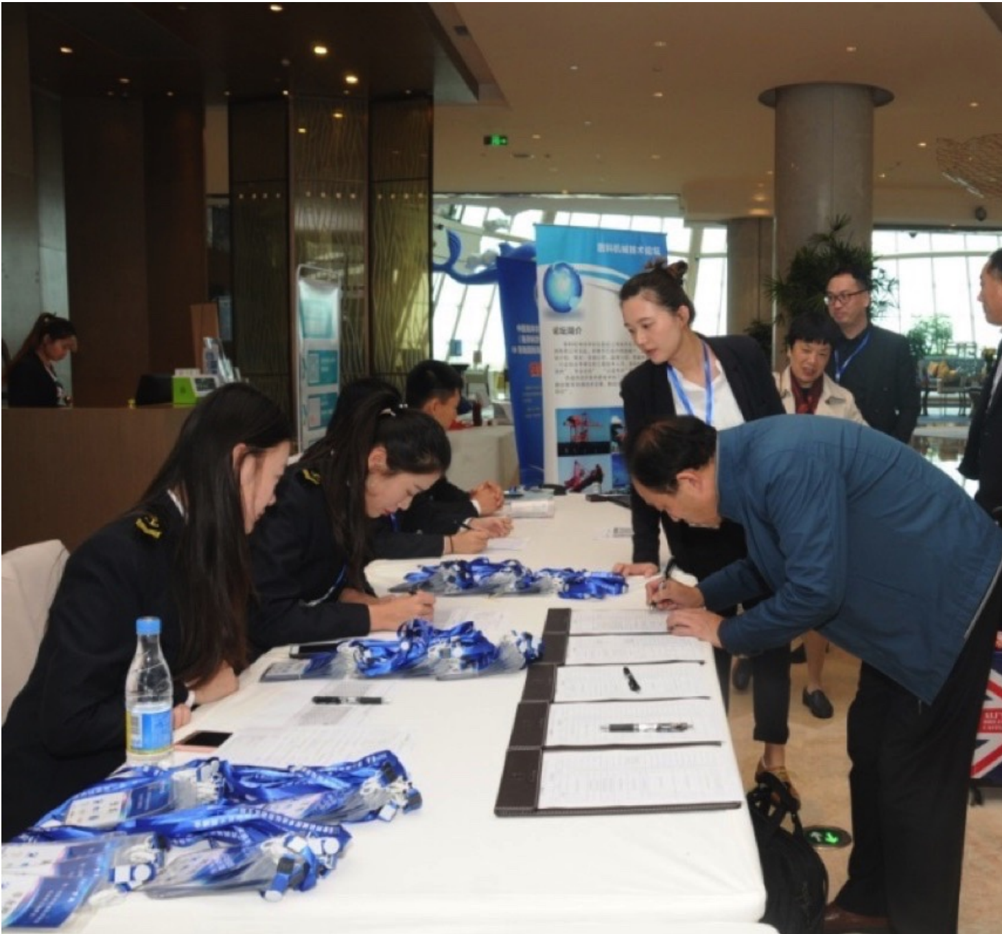
Impressions of the conference reception desk: participants registering.