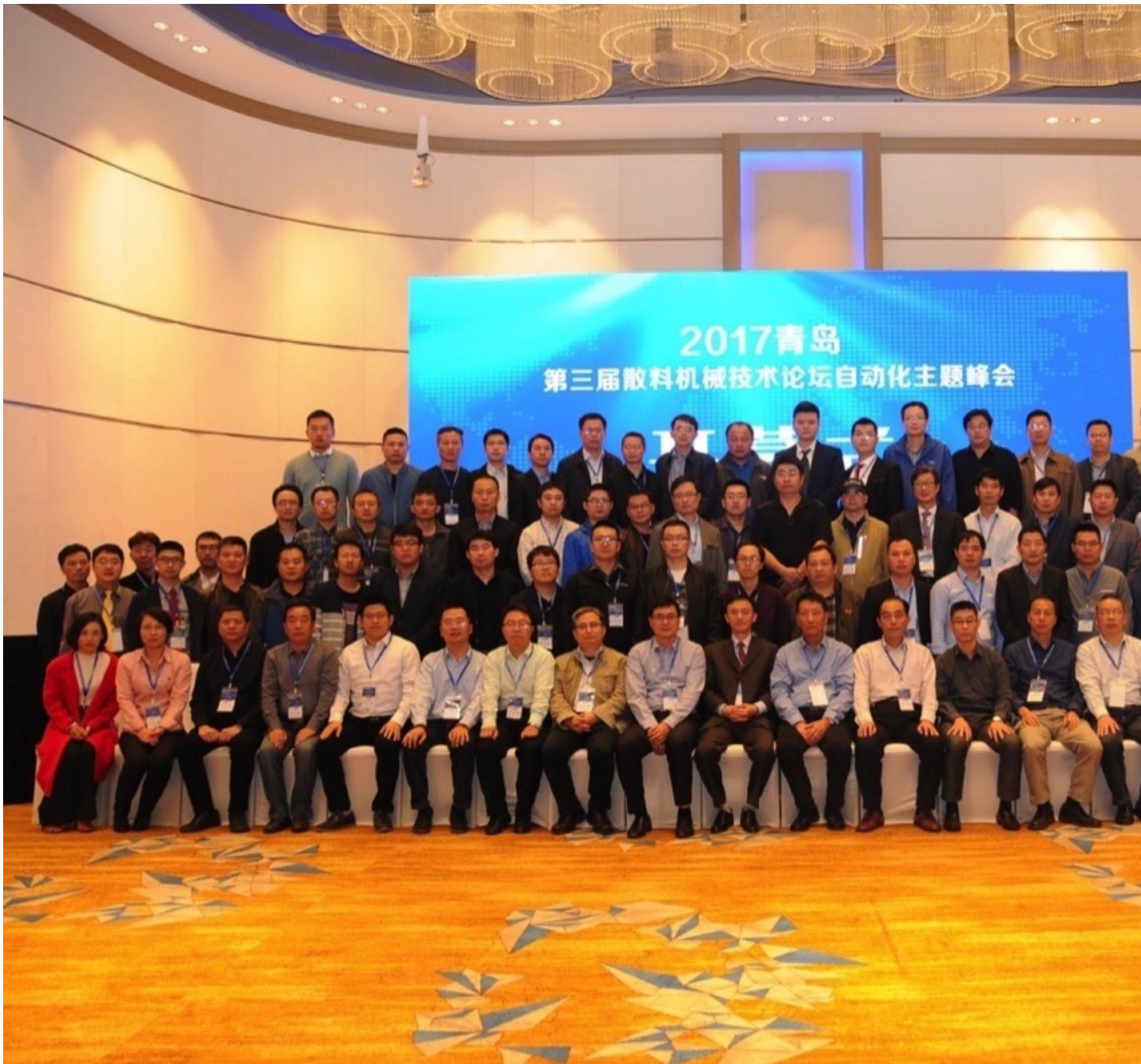
Participants of the conference came from end-users, OEMs, universities, design institutes, consulting companies, suppliers, etc.