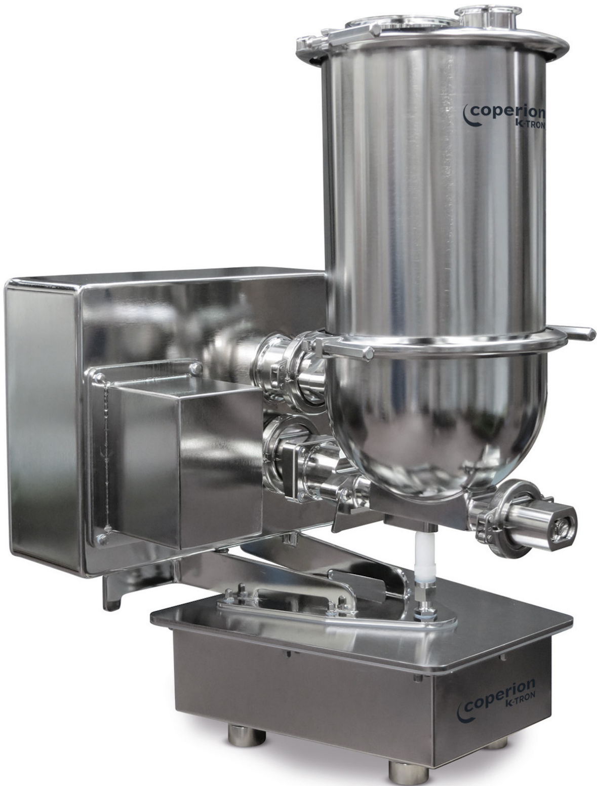
Coperion K-Tron's new QT20 pharmaceutical feeder with a redesigned trapezoid scale shape and significantly smaller footprint is optimized for multi-feeder clusters around a process inlet.