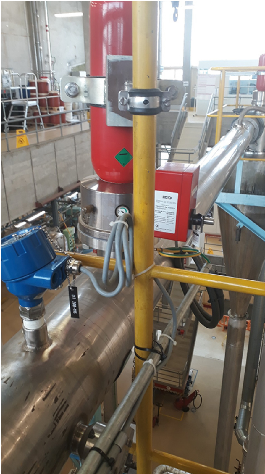
ProSens – Application.

A manufacturer of processed foods refines dairy products. The dust-laden exhaust air produced during the manufacturing process is extracted and cleaned by industrial filter systems. With increasing wear of the filter elements, the dust content in the exhaust air can rise and lead to an increased environmental pollution. A continuous dust measurement ( \text{mg}/\text{m}^3 ) is even officially prescribed