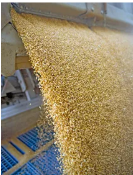
Fig. 1: Solids flowmeters are used in any industry from food to power generation.

Solids flowmeters are an interesting solution to indicate flow rates in pipes and chutes. “Interesting” because they are only moderately accurate, costly, require a lot of tuning after installation and are usually only as good as the whole process around them. Nevertheless, the technology exists – because there isn’t anything else that can do the job.