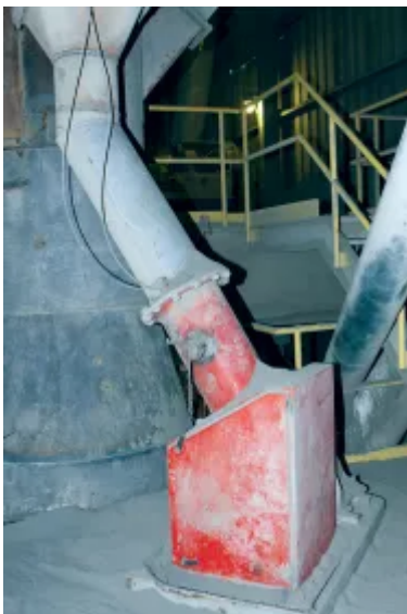
Fig. 4: St. Marys Cement in Canada has been using the Siemens E-300 solids flowmeter for over two decades.

I have been working with flowmeters for eight years and I consider myself to be well versed. I have colleagues who have been working with this technology for 35 years and they consider themselves to be experienced. However, I have yet to meet anyone who considers himself or herself a flowmeter expert!