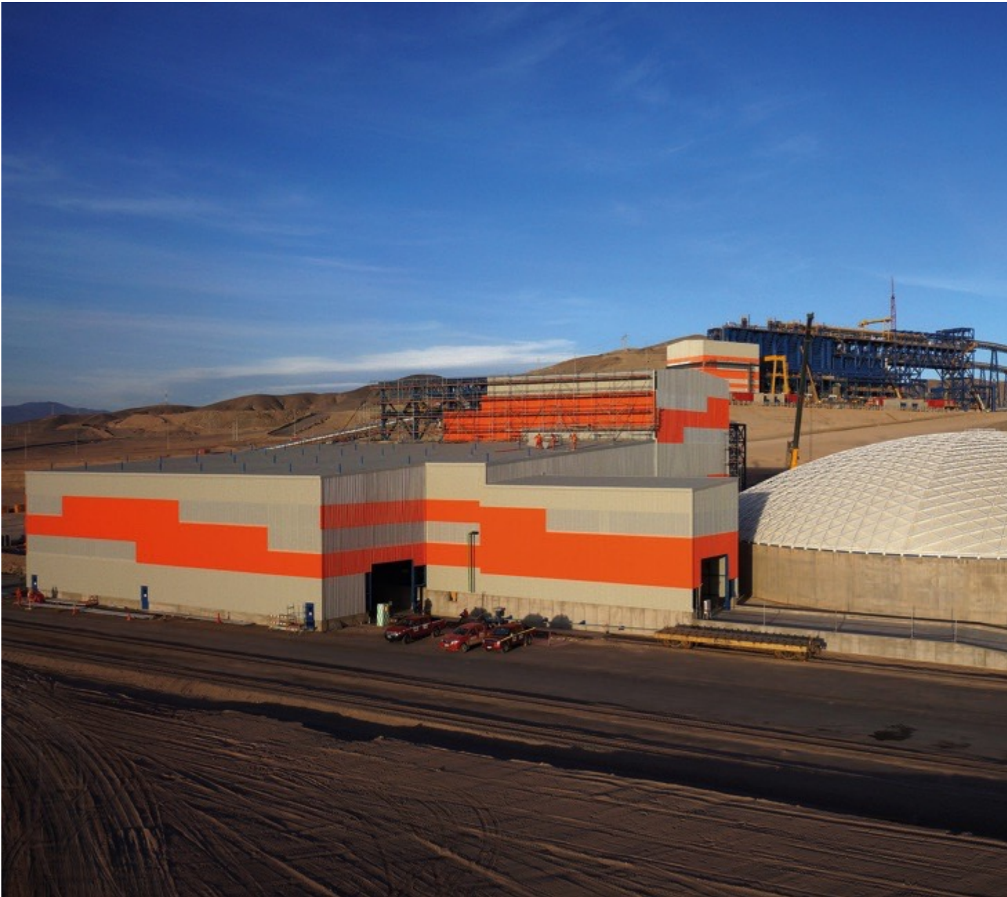
Internal cladding protects the 62m building from a stockpile of concentrate.

the joint is strong, sometimes even more than the joined tubes themselves. Most importantly, the tubes resist bending moments at the joint. This allows for the deck or cladding of the structure to be affixed directly to the space frame members, without secondary structural purlins that can be as heavy as the frame itself in other construction systems. This feature also permits many variations on basic geometries that are simply not possible with conventional bolted or welded connections. These virtues allow for unlimited forms, and the judicious selection of form results in beautiful and efficient long-span structures.