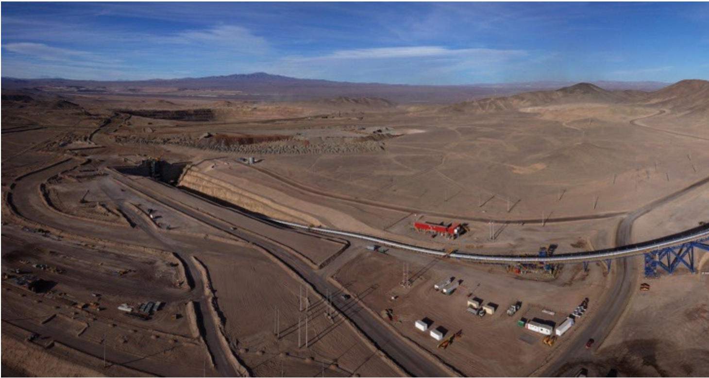
7th Grande development

Sierra Gorda Sociedad Contractual Minera (Sierra Gorda SCM) is acclaimed as the seventh largest copper and molybdenum development on planet earth — a distinction demonstrating the demand for copper, the strength of copper prices, and the dominance of northern Chile as a coveted copper producing region. In fact, Sierra Gorda is a joint venture between KGHM International, Sumitomo Metal Mining and Sumitomo Corp., and has successfully intertwined the economies of three countries: Chile, Poland and Japan. Concentrate was first produced in July 2014, followed by an opening ceremony October 1 attended by dignitaries from the Republic of Chile headed by President Bachelet, the Republic of Poland government, the Japanese government, as well as representative construction and operational partners. In December the mine produced approximately 700 daily tons of concentrate. According to KGHM Polska Miedź, production will ramp up to 120 000 metric tons of copper, 50 million lbs. of molybdenum and 60 000 oz. of gold annually.