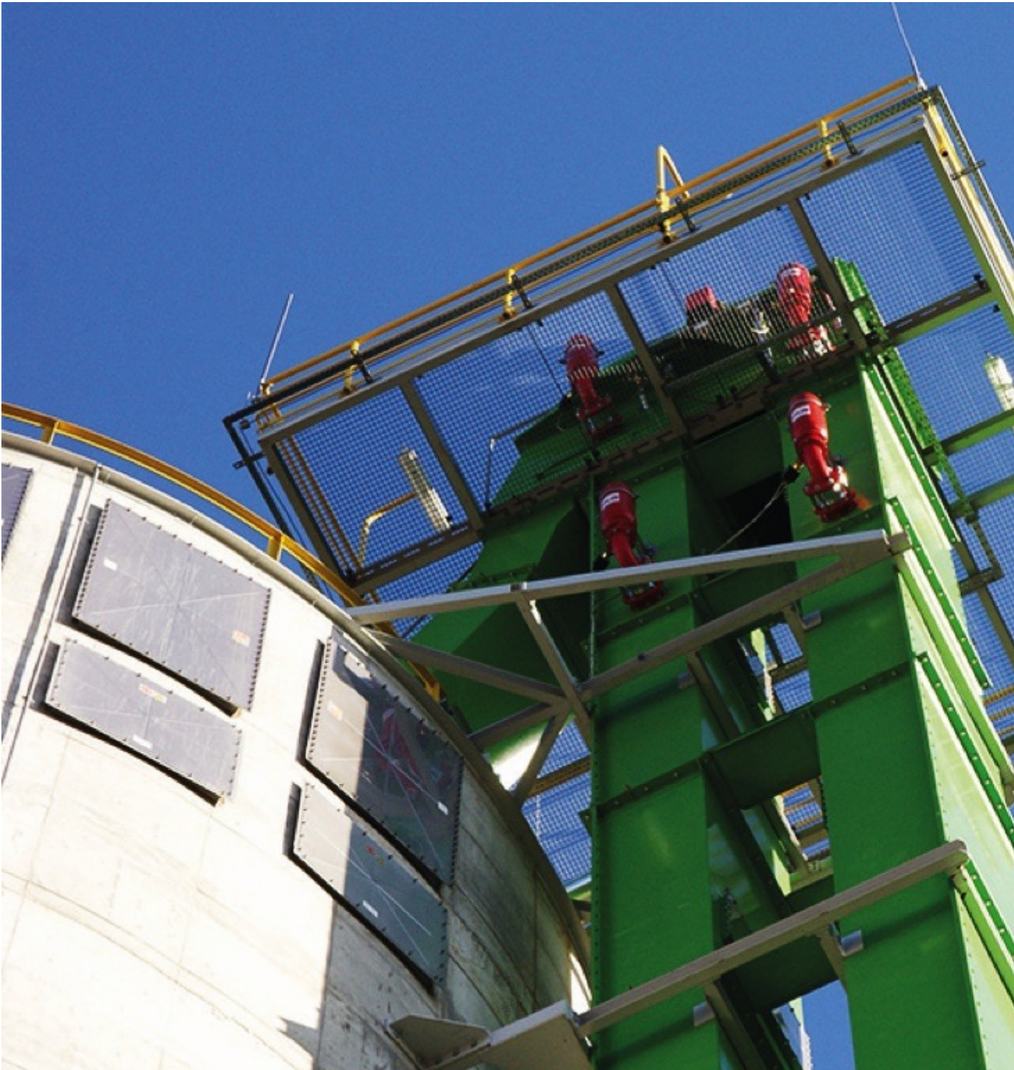
Bucket elevator with explosion control measures.

atmosphere occurs inside these conveyors, for example redler, pipe-chain, belt and Z type conveyors or bucket elevators. Due to the material transport principle in a bucket elevator there are inevitable factors, whose consequence may be an explosion. Such explosion risk is significant; therefore it is necessary to protect these vertical conveyors.