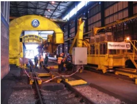
Fig. 4: Side arm charger with electro-mechanical drive and festoon arrangement for power supply.

In a mobile machine like side arm charger, indexer and puller cum pusher of transfer platform, it is recommended to provide electro-mechanical drives with VVVF control. We can place the VVVF panel in a separate closed pressurized dustfree room inside the control tower, and the power is supplied to the drive motors through flexible cables using an energy drag chain or a festooning arrangement. Such an arrangement is not possible with hydraulic drives.