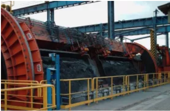
Fig. 2: Tandem tippler working at Vale's Tubarao Terminal, Brazil.

At the port of Tubarao in Brazil, five tandem tipplers supplied by ThyssenKrupp are in operation - each having a handling capacity of two 120 ton (gross weight) wagons with rotary coupler at 45 dumping tips per hour of iron ore.