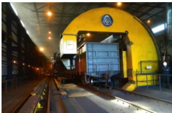
Fig. 1: Tandem tippler working at the Ust Luga coal export terminal, Russia.

Railway transport is one of the most important means of transport for huge amounts of dry bulk solids. Often, train unloading is a bottle neck of such systems. A solution to this problem is presented in the article below.