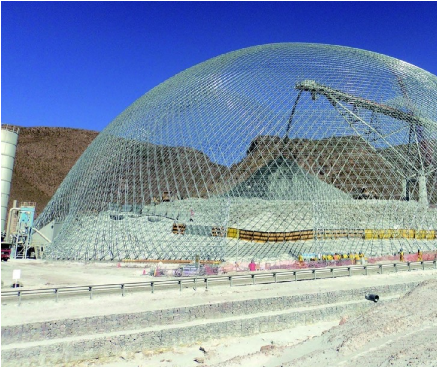
Fig. 1: The 140 metre diameter dome at the San Cristobal Mine in Bolivia was constructed without interrupting the stockpiling operation.

The finished stockpile containment structure is a dome 140 metres in diameter and 59 metres in height anchored by concrete foundation – the largest dome of its kind in South America. The foundation, which accommodates a nine metre change in elevation over 140 metres, is fitted to the terrain. The dome is designed to withstand wind speeds of up to 150 kilometres per hour and an ice load of 110 kilogrammes per square metre. The Geometrica dome at San Cristobal Mine is made up of more than 88,000 galvanized steel tubes organized and inserted into aluminium hubs to form the structure. Local crews recruited by Caballero built the dome as deliveries arrived on site. Shipments consisted of