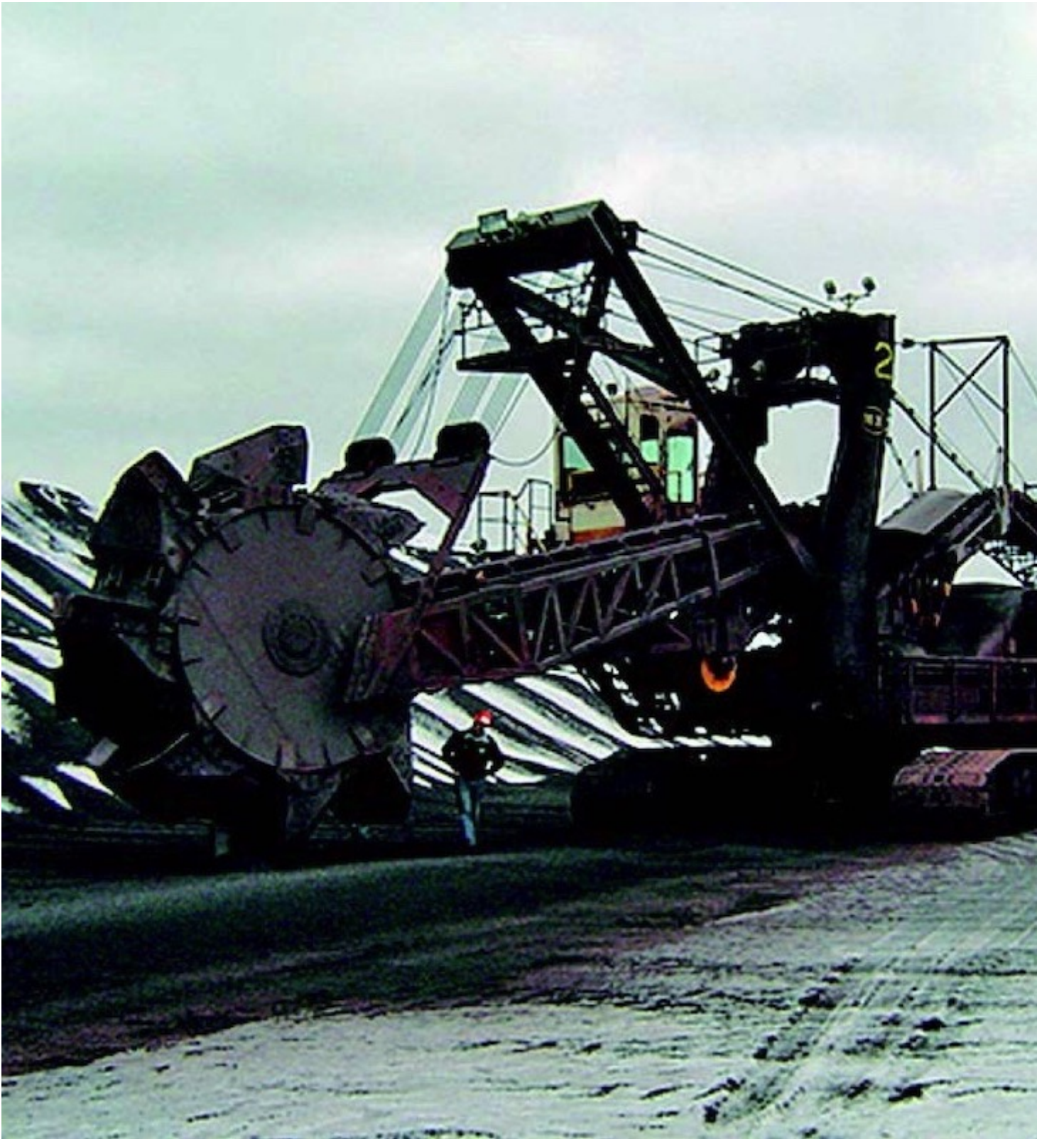
Fig. 6: One of three 40 year old 4000 tonne per hour bucket wheel reclaimers upgraded by BNSF with three Rulmeca motorised pulleys (one