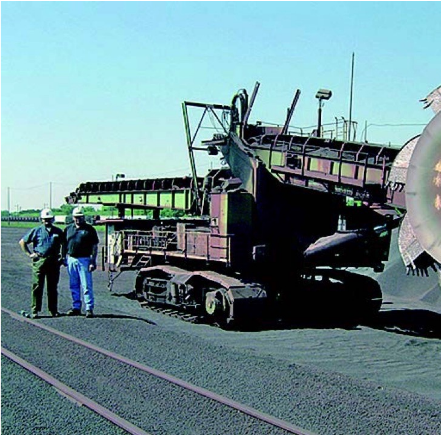
Fig. 3: Installed in 1985, the two Rulmeca motorised pulleys working in the bucket wheel reclaimer at Escanaba Ore Terminal are now in their 27th shipping season.

The Escanaba Ore Terminal, owned and operated by Canadian National Railway Company (CN), is located on the Upper Peninsula of Michigan and serves the iron mines in the region. It unloads 8 million tonnes per year of taconite iron ore pellets from rail cars, stockpiles them, and loads them onto Great Lake vessels bound for Chicago-area steel mills.