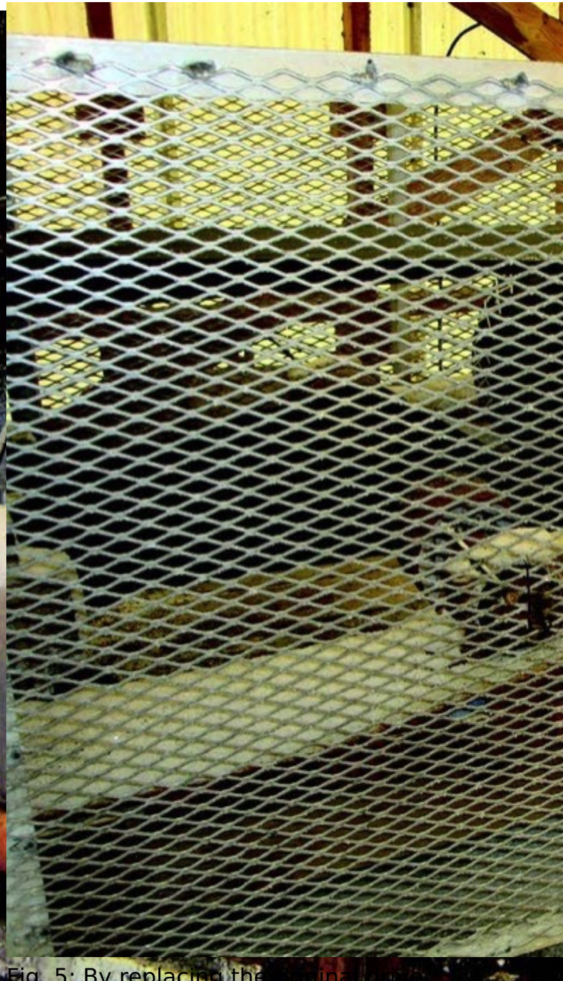
Fig. 5: By replacing the original drive system with a 60 horse power (approx. 45 kilowatt) Rulmecca motorised pulley, Cargill eliminated all exposed components.

Cargill has standardised on three Rulmecca motorised pulley models (i. e. 500M, 630H, and 800H) to limit the number of spares protecting the system. This is possible because only two different belt widths are used in the entire barge loading system. The models are: 500M at 20 horse power (approx. 15 kilowatt) and 480 feet per minute (approx. 2.4 metres per second) with 31.5 inch (approx. 0.8 metre) face width, 630H at 60 horse power (approx. 45 kilowatt) and 600 feet