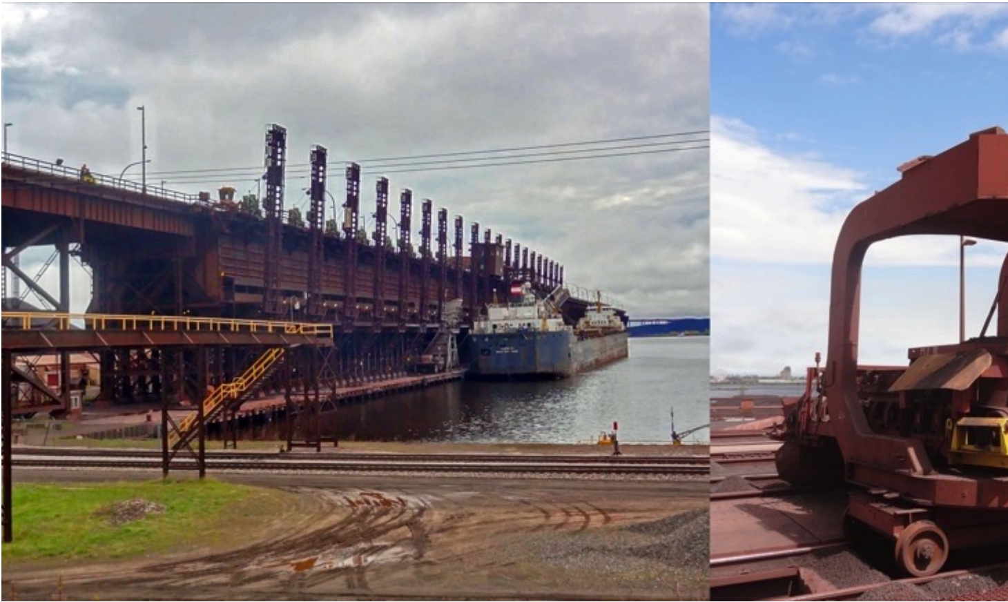
Fig. 2: The Duluth Dock ship loader conveyors load ships at up to 10000 tonnes per hour (left). A shuttle conveyor transfers ore from ground storage into 60 hoppers in dock; the close-up of the West end of the shuttle conveyor (right) shows the 180 horse power (approx. 135 kilowatt) Rulmeca motorised pulley discharging ore into north hopper via articulating boom.

Each of the motorised pulleys operates independent of the other. The east drive is energised to move material eastward and the west drive is energised to move material westward. An enclosed cab is positioned at each end of the shuttle conveyor to provide a clear line of sight to the operator. For example, when material is transferred west, the operator sits in the west cab to control shuttle travel and location of articulating boom. This enables the operator to position the shuttle conveyor and the articulating transfer boom conveyor above the north, central, or south ship loader hoppers. Up to 20 ship loader conveyors transfer ore directly from the dock pockets onto Great Lakes ore ships up to 1000 feet (approx. 300 metres) in length.