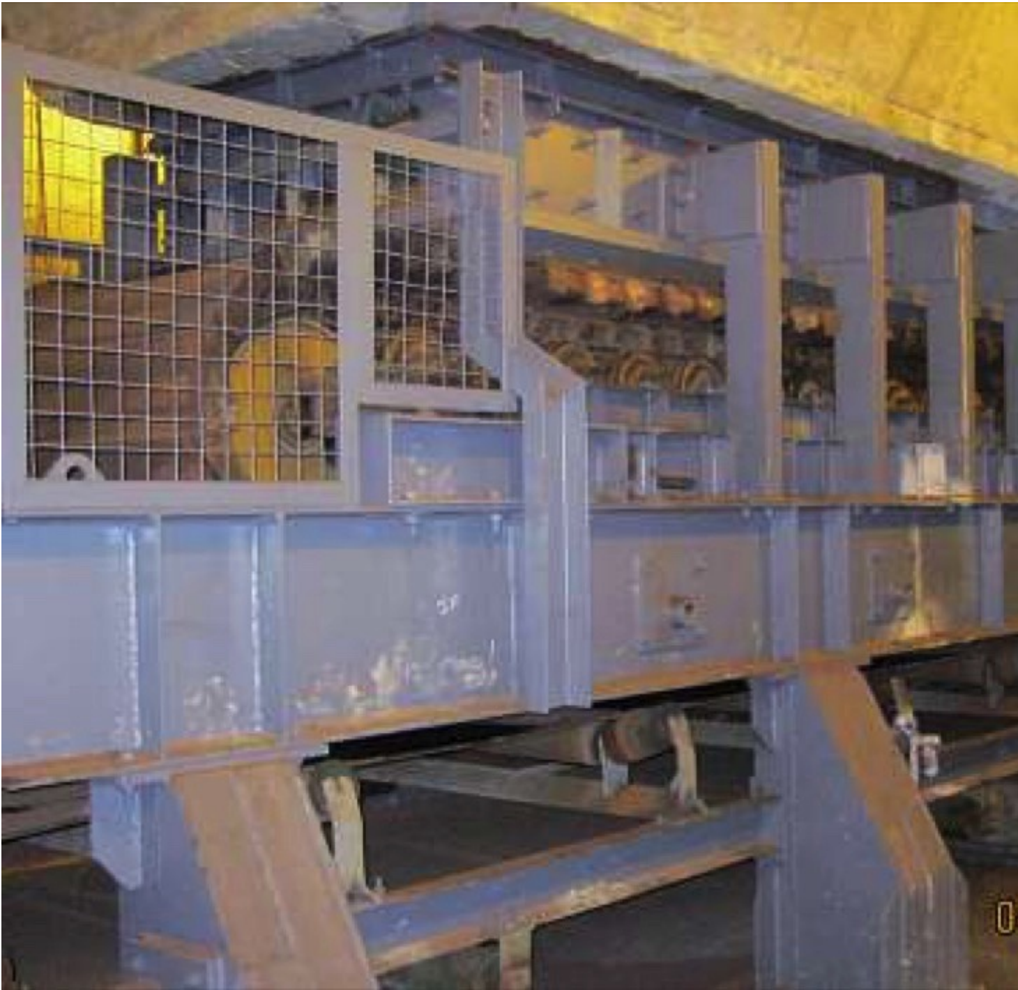
Fig. 4: Like paddle feeders, apron feeders under hoppers are subjected to high torques.

In Paddle Feeders, operating under hoppers, are subjected to high starting torque. In addition high torque is encountered due to compaction of material, particularly when the machine is started after a long shut down. During operation also sometimes the discharge arms have a tendency of getting jammed or close to jamming situation. Paddle Feeder manufacturers generally keep a provision of at least 50 percent higher torque than the normal operating torque to cover up the requirement during starting and jamming situation. Nowadays, some users demand 100 percent. During starting or jamming higher speed naturally have no