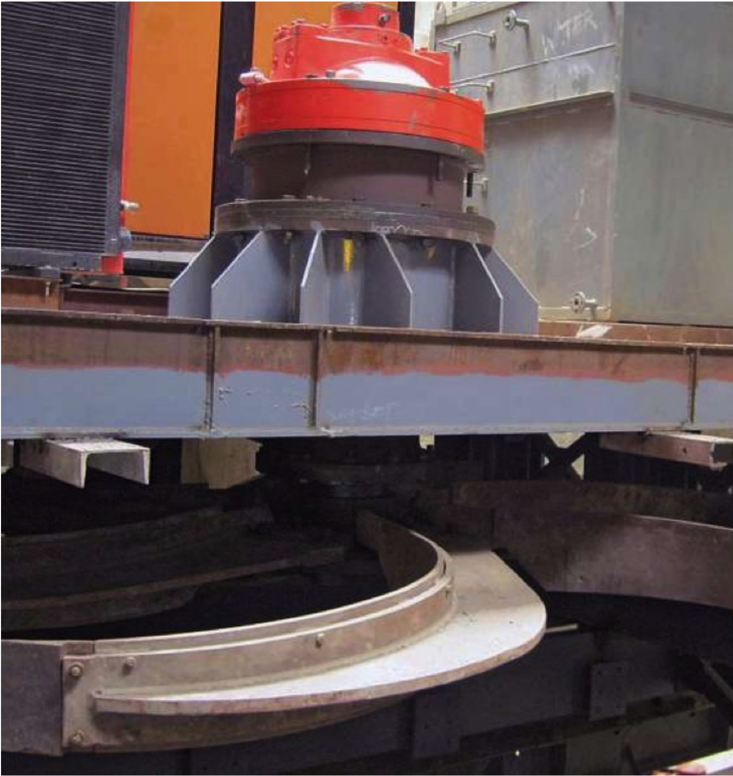
Fig. 1: Paddle feeders operating under hoppers are subjected to high torque; adopting a variable displacement hydraulic motor significantly reduces the size of the equipment.

In every machine there is always a challenge to design a drive chain as close as possible to the output required. If the requirement follows a defined cycle, the solution becomes easy. However, if the output is not cyclic and maximum load