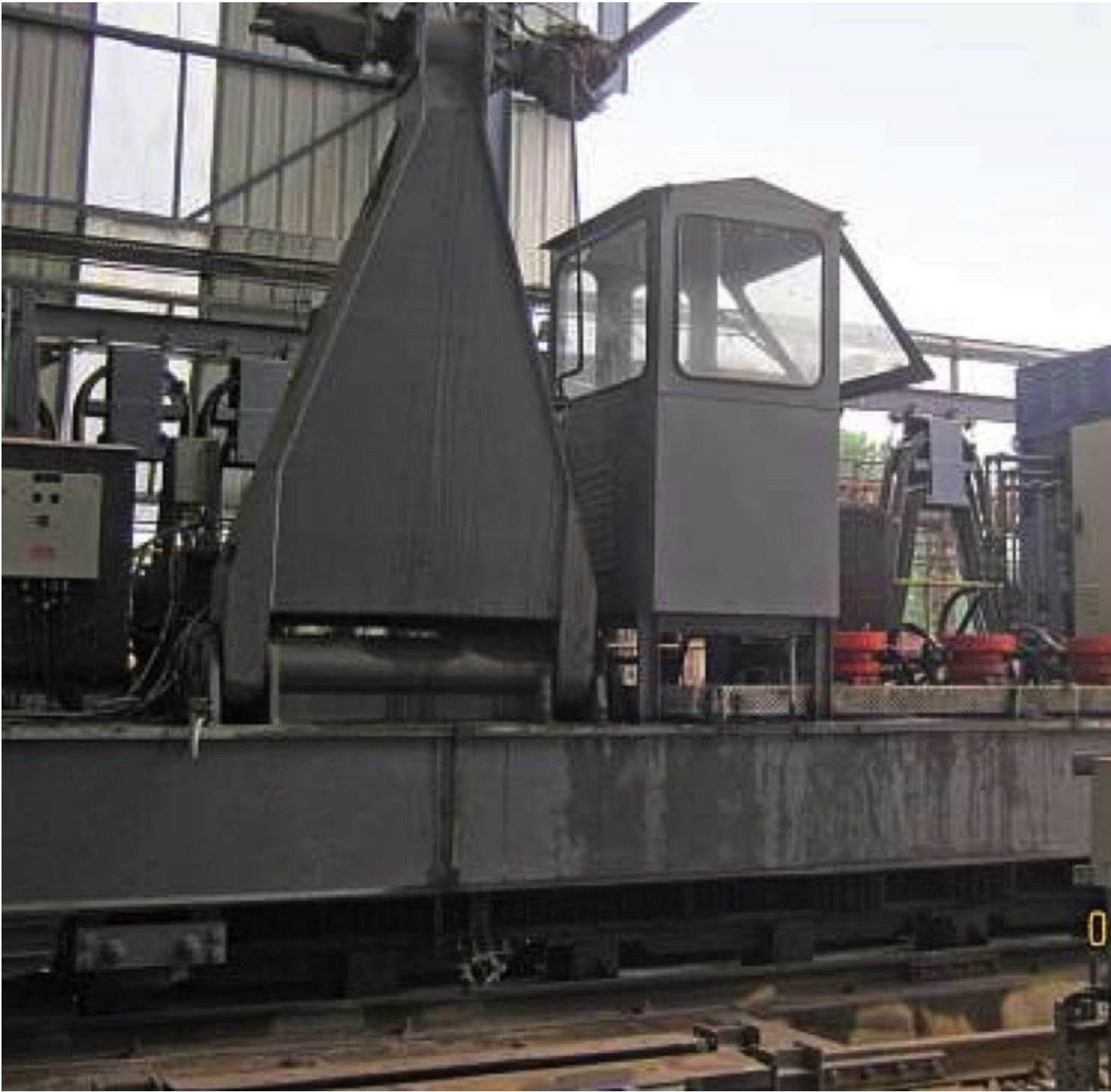
Fig. 5: In wagon positioning systems, motors are selected according to high pull forces for full rake.

In wagon positioning equipment like Side Arm Charger, motors are generally selected to satisfy high pull for full rake associated with some faulty brakes. The system remains under-utilised when such adverse situation does not exist and number of wagons in the rake gets reduced. Variable displacement motors can manage all such conditions judiciously by using much lower capacity prime mover and power unit. There may be many other applications in material handling where variable displacement motor can replace fixed displacement. Reduction in sizes of