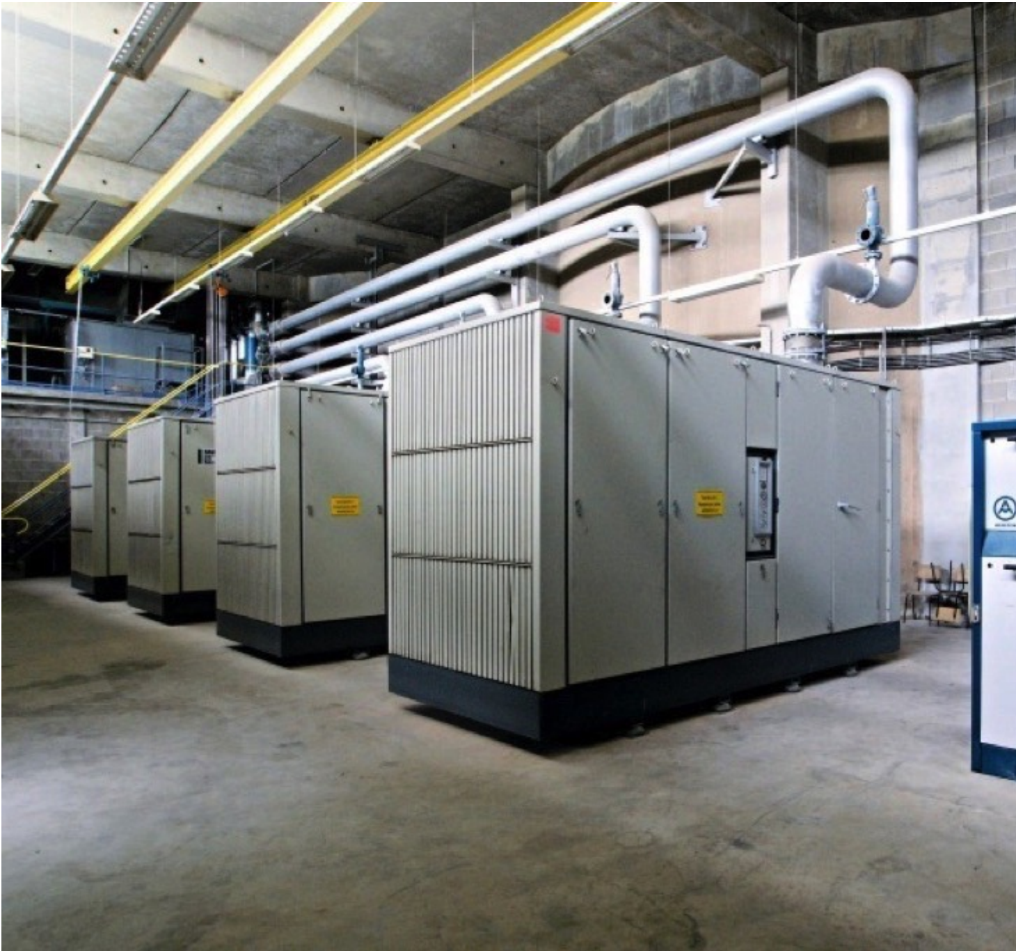
Fig. 3: The Delta Hybrid blower (right) in the central air supply station of the Karsdorf cement plant.

These two systems are an ideal combination with plenty of advantages. The new packages have been designed for all applications where air and neutral gases are conveyed up to 1.5 bar, e.g. in sewage plants, in the chemical industry, the power plant technology or for the transport and unloading of powdery material. This new rotary piston series have been successfully tested since three years within a big field test. This test referred to various branches, addressed to Aerzen customers under consideration of new requirements at roughest practical conditions. All field test units have been monitored by Aerzen remote control RAT in detail and continuously. The new units are available in the following rating ranges: