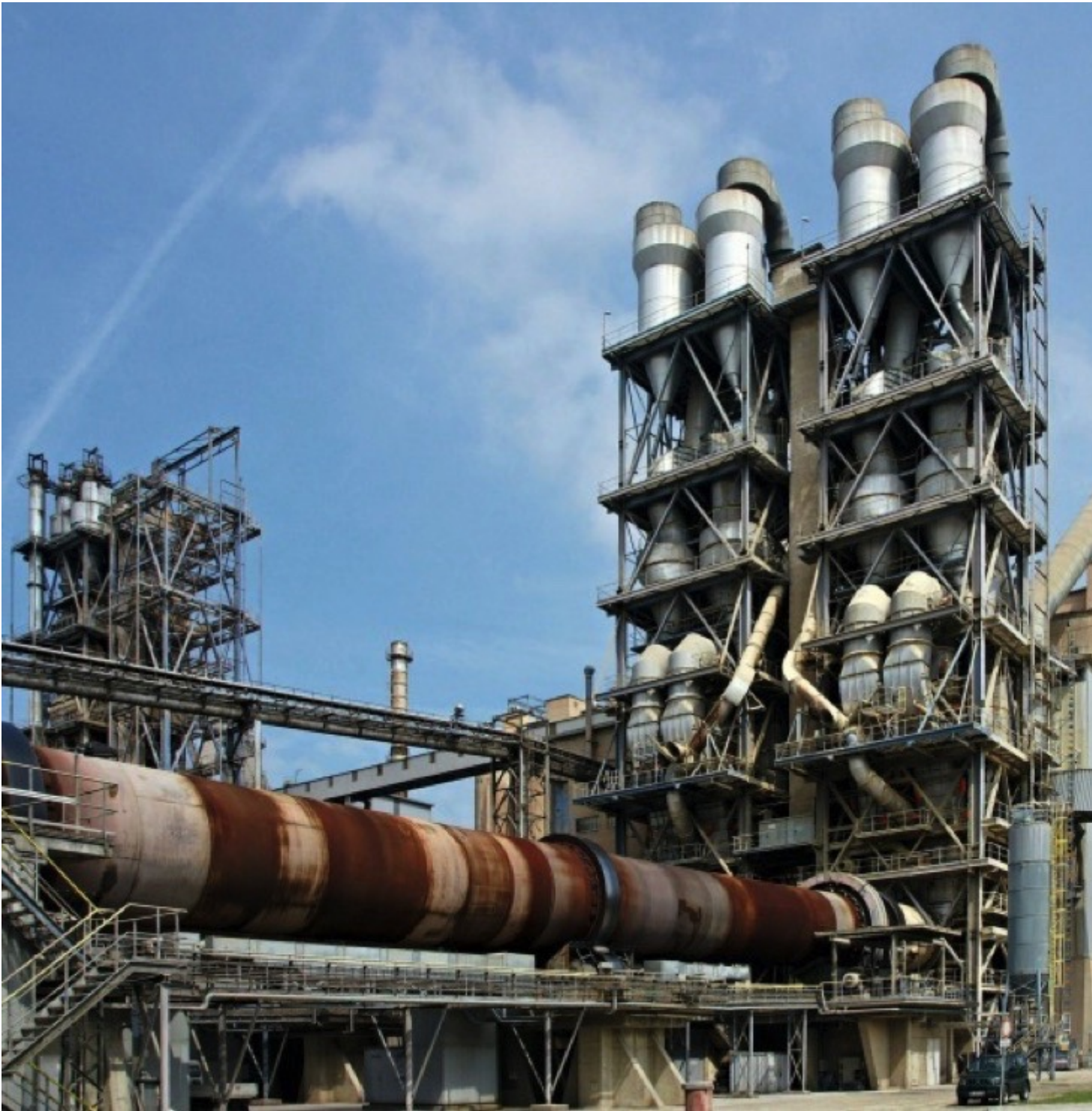
Fig. 1: At Lafarge's Karsdorf cement plant in Germany more than 50 screw compressors and positive displacement blowers from Aerzen ensure a smooth production process.

The Lafarge cement plant in Karsdorf, Germany, is a good example for the manifold application of compressed air in the cement industry. In this plant, more than 50 screw compressors and positive displacement blowers of Aerzener