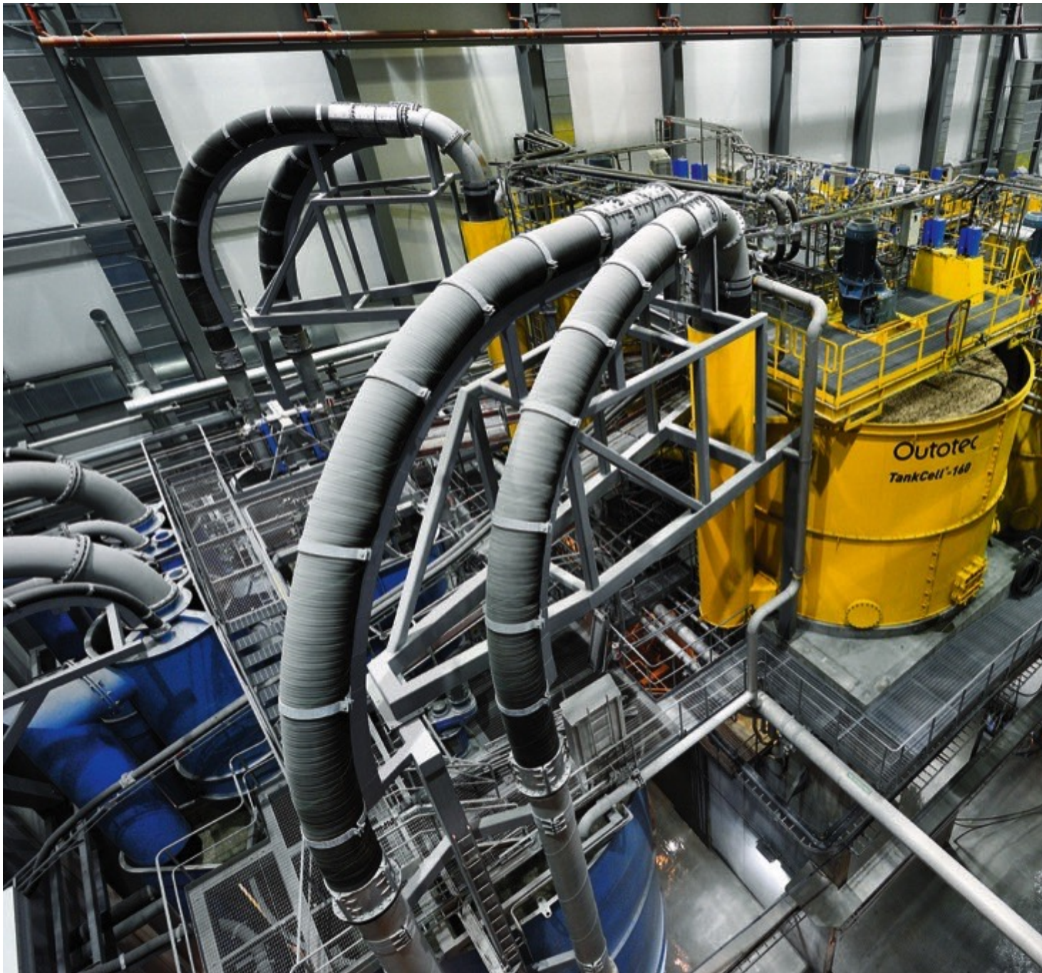
Fig. 1: With the new asset management system, Boliden handles the information of about 4500 instruments at its Aitik mine in Sweden.