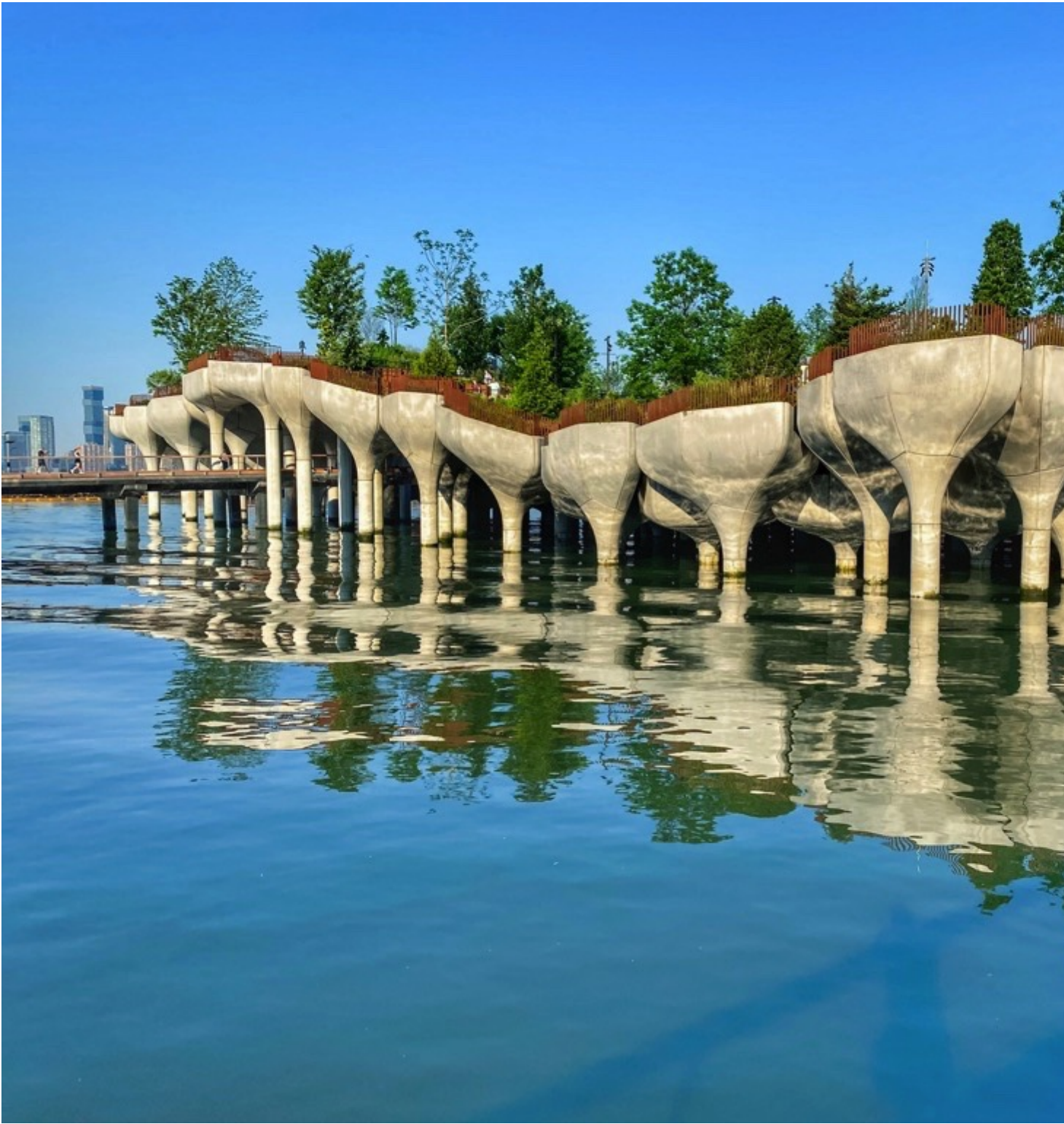
“Little Island” consists of 132 concrete tulips rising from the water.

The planning phase for Pier 55, now known as "Little Island", dates back almost ten years, with the foundation stone being laid in 2018: Concrete piles had to be driven into the ground to make the island, designed to accommodate several thousand people, possible. The project was realized through partnership with the