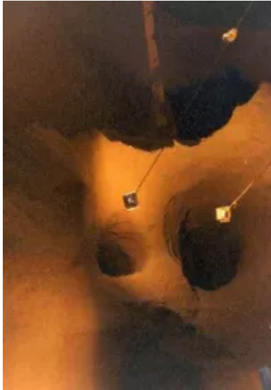
Fig. 2: Rat holes formed in the bunker.

Although the huge bunker has a potential capacity of 4000 tonnes, the true useable capacity of the 3000-tonne section was nearer to 1500 tonnes. This was due to the phenomenon of 'rat holing' (Fig. 2) where a significant quantity of the contents was effectively trapped around the periphery of the bunker with only the central core of coal directly above the outlets flowing from the bunker into the charge cars. This meant that only a modest portion of the silo's contents was retrievable – that which can flow through the 640-millimetre diameter outlet via a flow channel that flares to approximately 1 metre diameter over a depth of up to 10 metres. The bunker geometry and construction caused the residue to remain even when the central flowing channel is emptied (ratholing). Occasionally the narrow flow channel itself would arch, preventing flow completely.