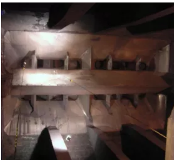
Fig. 4: Two rows of inserts installed in the 1000 tonne section.

The first row of inserts made such a huge difference to the flow of coal from the bunker; that a financial case was put together to line a further three rows of outlets. There are now two rows of inserts in the 3000-tonne section and two rows in the 1000-tonne section (Fig.4).