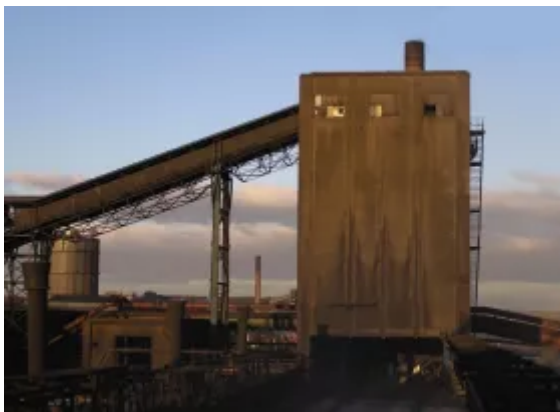
Fig. 1: Service bunker at Appleby Coke Ovens in Scunthorpe, United Kingdom.

In the ironmaking process, molten iron is produced in a blast furnace using agglomerated iron ore, limestone and coke. The coke is produced in large coke ovens from coal with special properties. Coal is crushed and blended on the Scunthorpe site and transported to Appleby Coke Ovens via a series of belt conveyors. It is then stored in a large concrete service bunker which is sited above, and in the centre of the oven batteries.