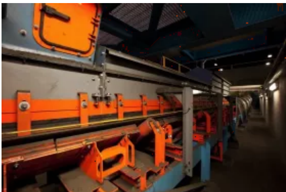
Fig. 3: Martin® ApronSeal™ Skirting is a dual-sealing system, with a primary seal clamped to the steel skirtboard and an “outrigger” strip to capture fines and dust.