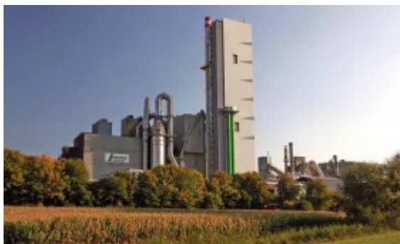
Fig. 1: In the course of a modernisation project at Lafarge's Wössingen cement plant, the capacity of the bucket elevator to the mill bunker has been increased considerably.

Lafarge's modernisation of the production facilities at its plant in the town of Wössingen, Germany, also included an existing belt bucket elevator. Thanks to a new technology, this elevator could be easily altered and his service life considerably be increased.