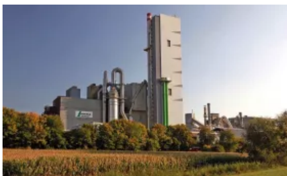
Fig. 1: In the course of a modernisation project at Lafarge's Wössingen cement plant, the capacity of the bucket elevator to the mill bunker has been increased considerably.

Lafarge's modernisation of the production facilities at its plant in the town of Wössingen, Germany, also included an existing belt bucket elevator. Thanks to a new technology, this elevator could be easily altered and his service life considerably be increased.