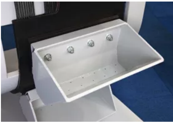
Fig. 2: The new bucket shape ensures smoother running.

At first, the engineers from the Wössingen plant wanted to replace the existing belt bucket elevator with a central chain bucket elevator. “We would have solved the problem with the transport of coarse-grained material”, Schenk says, “but a new central chain bucket elevator would have become quite expensive. “ In search of a suitable solution, the cement producer contacted some manufacturers of vertical conveyors – among others, the Beumer Group, headquartered in Beckum, Germany. The cooperation between Beumer