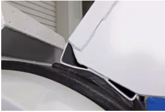
Fig. 3: There is no more gap between belt and bucket. The result is that material cannot get caught anymore during the scooping and filling process.

The buckets are mounted firmly to the back of the belt by segments and bolts. Belts with wire-free zones are used for the new heavy-duty bucket elevators just as with all Beumer belt bucket elevators. The buckets can be fastened to the belt without damaging the steel wires or even cutting them. The traction forces of the bucket elevator belt are maintained to full extend.