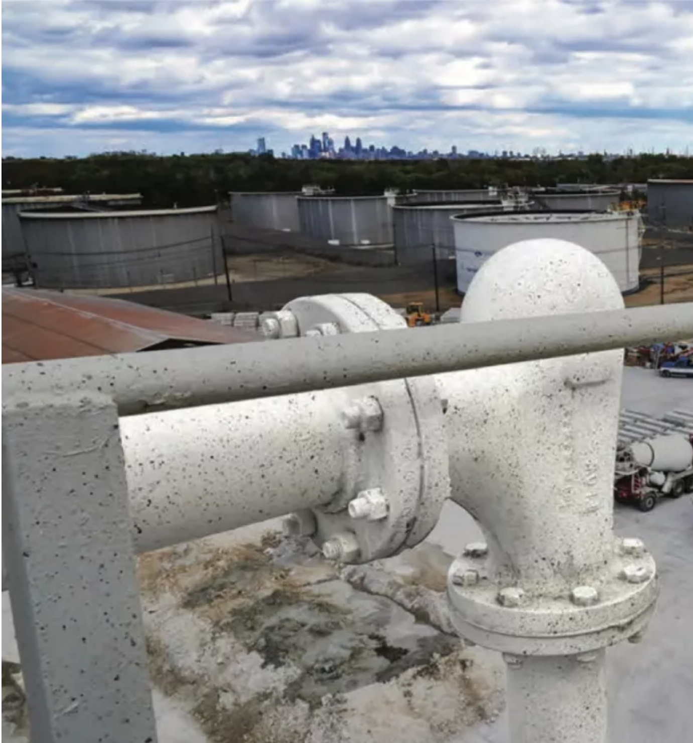
HammerTek short radius deflection elbows eliminated the need to weld or replace failed

Based on his initial elbow installation, Forlini has retrofitted all of the conventional elbows at his three ready-mix plants. The deflection elbows are incorporated into pneumatic lines that transfer cement powder as well as fly ash or brown slag used