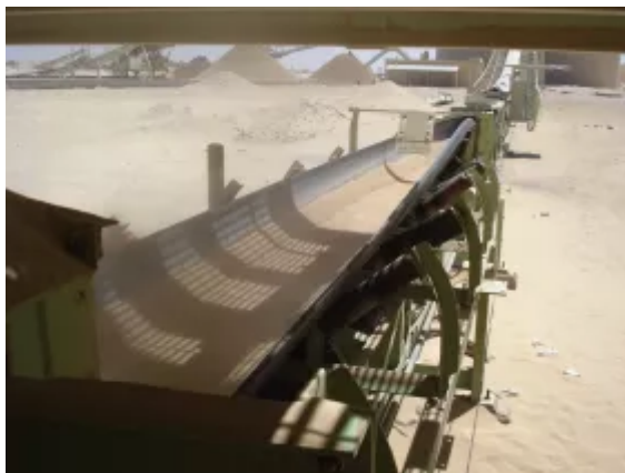
Fine materials act like sandpaper on the rubber surface.

It is a common misconception that a belt specified by a supplier as being 'abrasion resistant' should naturally be expected not to wear quickly. Different causes of wear and abrasion require different kinds of abrasion resistant covers. For example, belts that transport heavy and/or sharp objects such as rocks, timber or glass that cause cutting and gouging of the belt surface need different resistance properties compared to belts carrying 'fine' materials such as