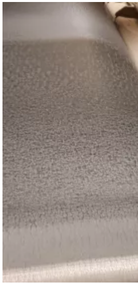
Close up of ozone cracked belt.

There is absolutely no question that ALL rubber conveyor belts should be fully resistant to the damaging effects of ozone and ultra violet light. This is because ozone becomes a pollutant at ground level. Exposure increases the acidity of carbon black surfaces and causes reactions to take place within the molecular structure of the rubber. This has several consequences such as surface cracking and a marked decrease in the tensile strength of the rubber. Likewise, ultraviolet light from sunlight and artificial (fluorescent) lighting also accelerates deterioration. This is because it produces photochemical reactions that promote the oxidation of the surface of the rubber resulting in a loss in mechanical strength. In both cases, this kind of degradation causes the covers of the belt to wear out even faster than it should.