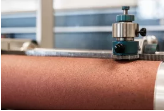
ISO 4649 / DIN 53516 abrasion testing.

There are two internationally recognised sets of standards for abrasion, EN ISO 14890 (H, D and L) and DIN 22102 (Y, W and X). In Europe it is the longer-established DIN standards that are most commonly used. Generally speaking, DIN Y (ISO 14890 L) relates to 'normal' service conditions. In addition to resisting abrasive wear DIN X (ISO 14890 H) also has good resistance to cutting, impact and gouging. DIN W (ISO 14890 D) is usually reserved for particularly high levels of abrasive wear.