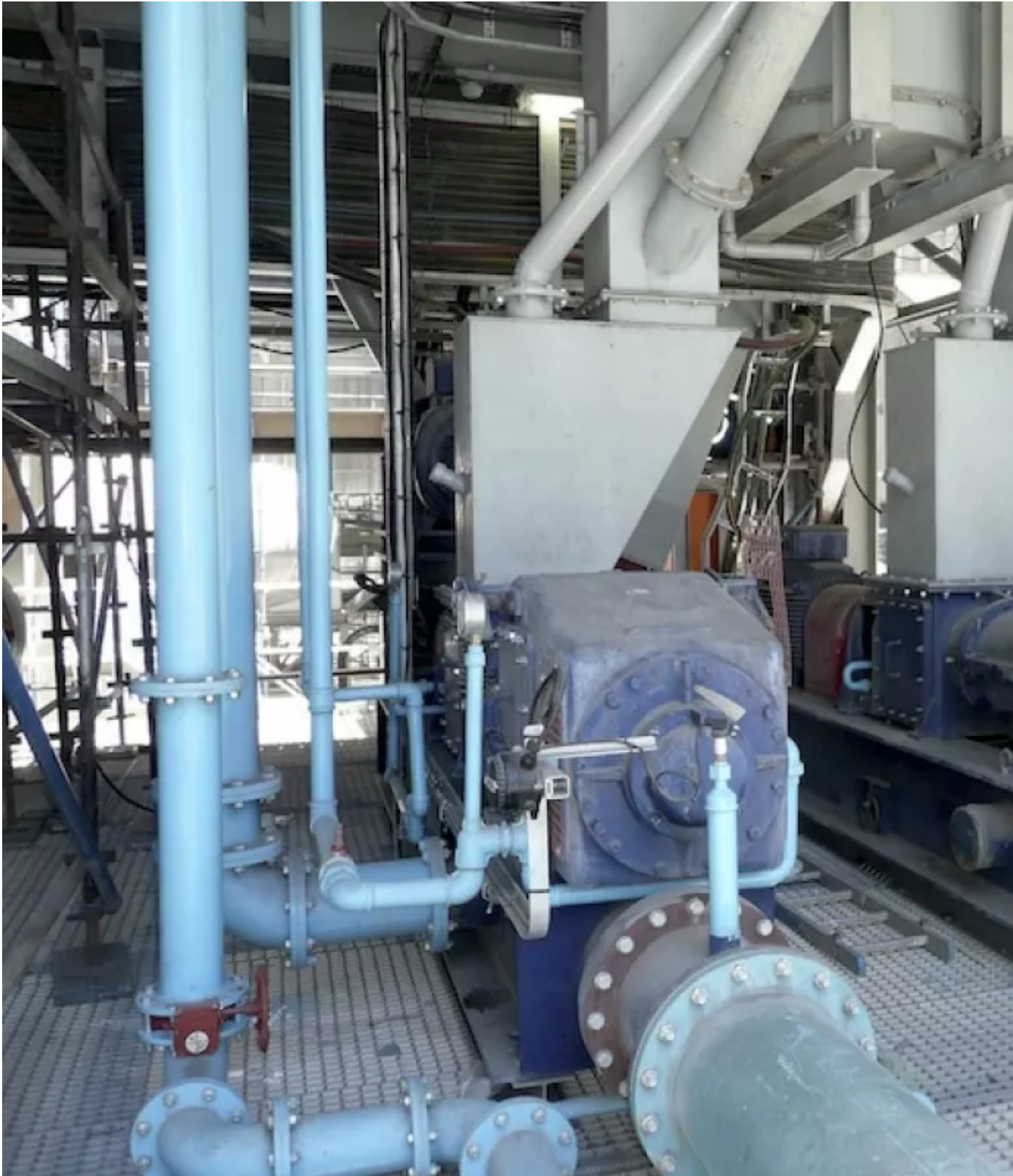
Fig. 2a: The two screw pumps before modification

With the help of pneumatic conveying the Duo-Cell silo and the packing plant are loaded. KREISEL ZSV-H has been installed so that it can load all three receiving points. The pneumatic transport proceeds over approximately 260 m with 53 m vertical routing. The conveying capacity is 150 tons per hour. The pressure