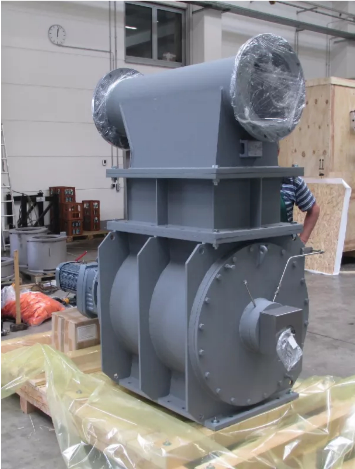
Fig. 3: KREISEL Ceramic rotary feeder Type 700x700-11 LU with mounted leakage air collector and with blow shoe, ready for transport

Kreisel engineered (see 3D planning extract Fig. 4) the integration of KREISEL ZSV-H in the existing plant configuration (see Fig. 5). For assembly, the existing support structures of the screw pump could be used. In a very short space of time