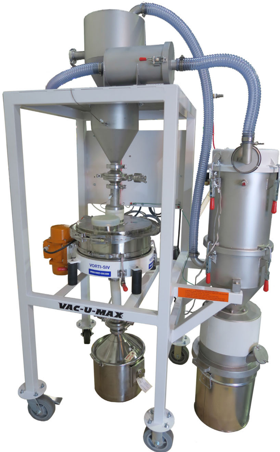
]: VAC-U-MAX Additive Manufacturing Metal Powder Recovery System (AM-MPRS) for conveying, screening, recovering and reusing metal powders in contained, dust-free continuous process