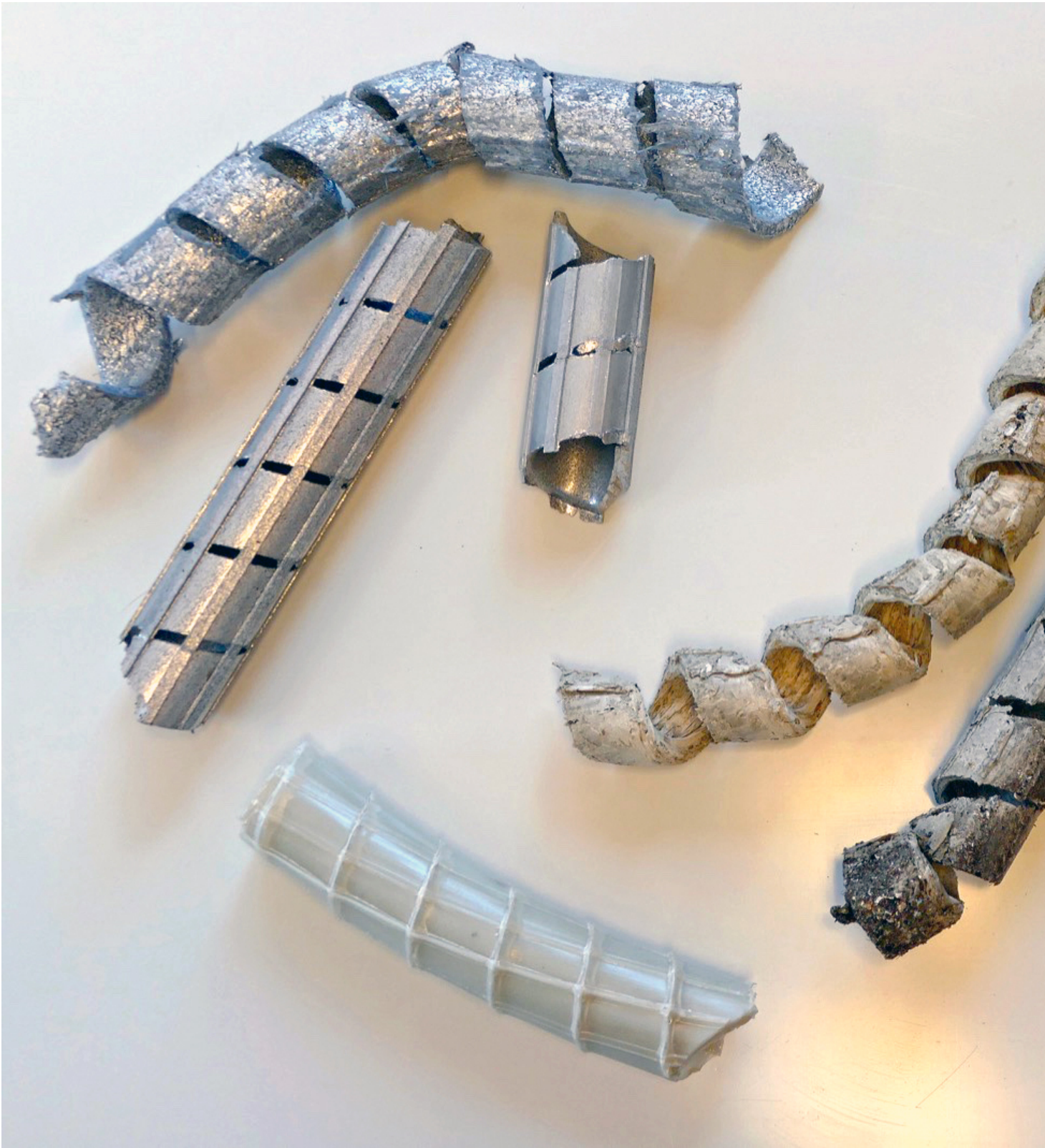
Various discharged contaminants: aluminum from plastic and aluminum foils (top left), silicone from cosmetic tube waste (bottom), refrigerator scrap comprised of silicone, paper, wood, rubber and cable remnants (right).