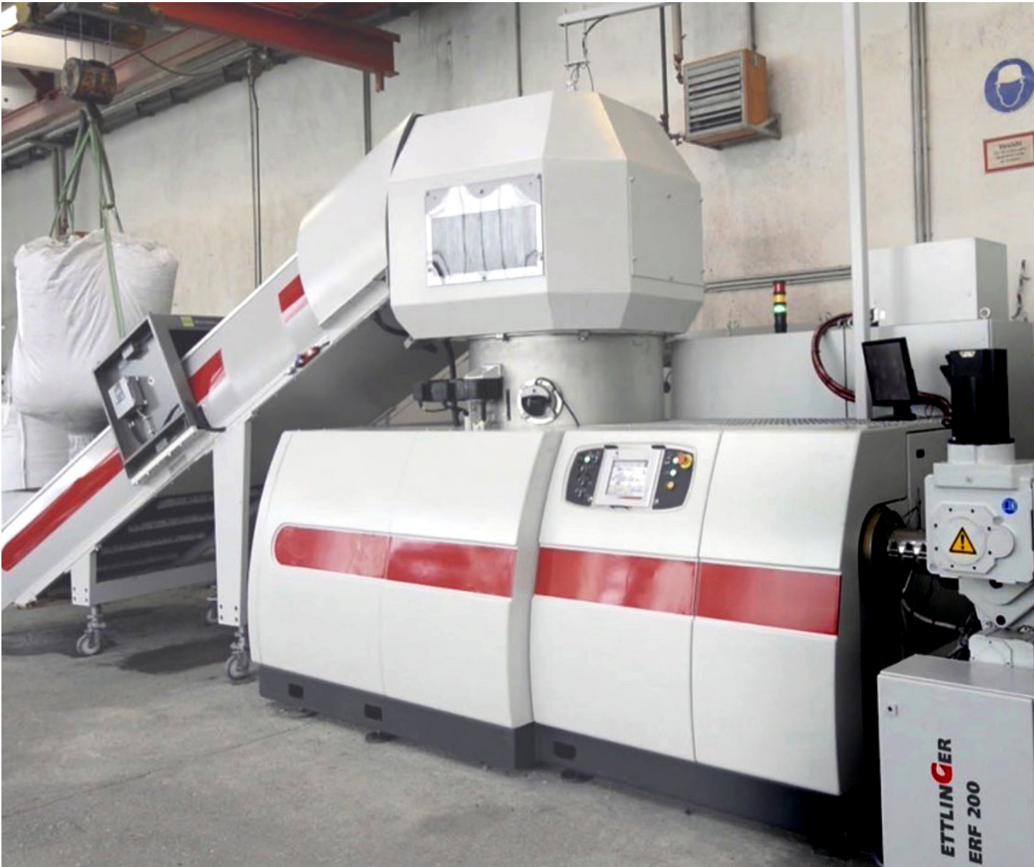
The ETTLINGER ERF 200 high performance melt filter on an extrusion line at CANDI is used to process industrial plastic waste containing 10% or more aluminum or paper.

materials recyclers. The company currently employs twelve people working three shifts. CANDI specializes in processing and repelletizing a broad spectrum of industrial plastic waste. In 2014, CANDI acquired a recycling line for treating plastic waste which is contaminated with paper or aluminum foil, for instance. At the heart of this line is a vacuum degassing extruder specially developed for plastics recycling: it melts the plastic waste which has been shredded and agglomerated by CANDI in an upstream step and homogenizes it extremely efficiently.