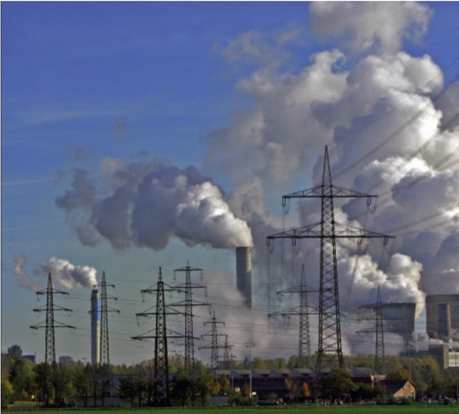
Visible from afar, the white plumes of power.

The future of electricity production belongs to renewable energies. Experts agree notwithstanding that up to the year 2040 non-renewable energies will have 80% of the energy mix worldwide. Actually, coal is the world's second most important fossil energy source after petroleum. In 2015, coal covered 29% of global primary energy consumption [1]. In Germany more than 40% of domestic power generation came from brown coal [2]. Domestic hard coal production is on the decrease due to the expiration of subsidies in 2018. By contrast, significantly more hard coal than brown coal is being produced globally. The flue gas formed by every coal combustion is being scrubbed in an ecologically responsible way in flue gas