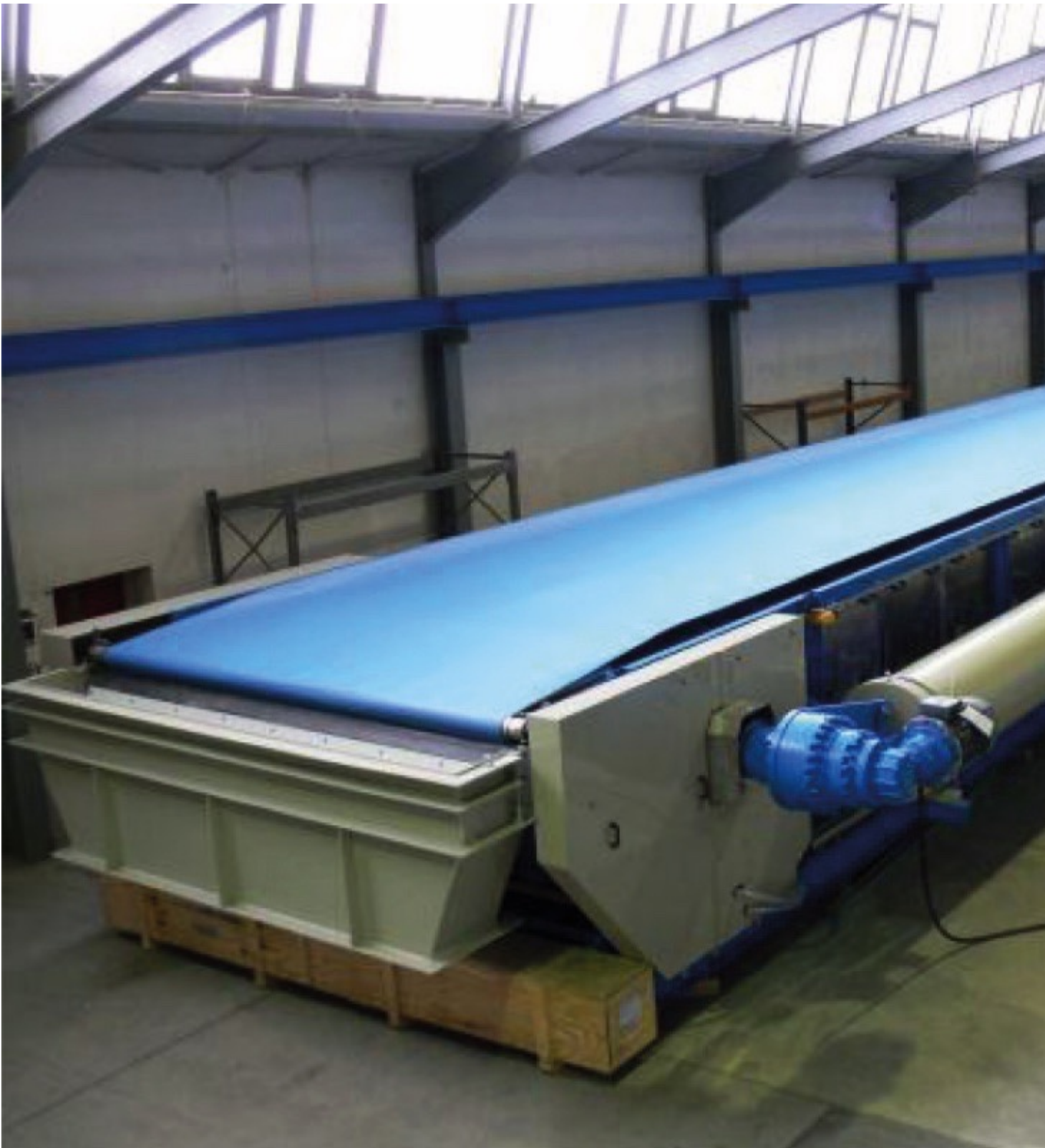
Belt filter for the lignite fired power station blocks with optimised plant technology in Neurath, Germany.

The core of the system for FGD gypsum dewatering in the new brown coal blocks with optimised plant technology in Neurath consists of two 35 metre long and