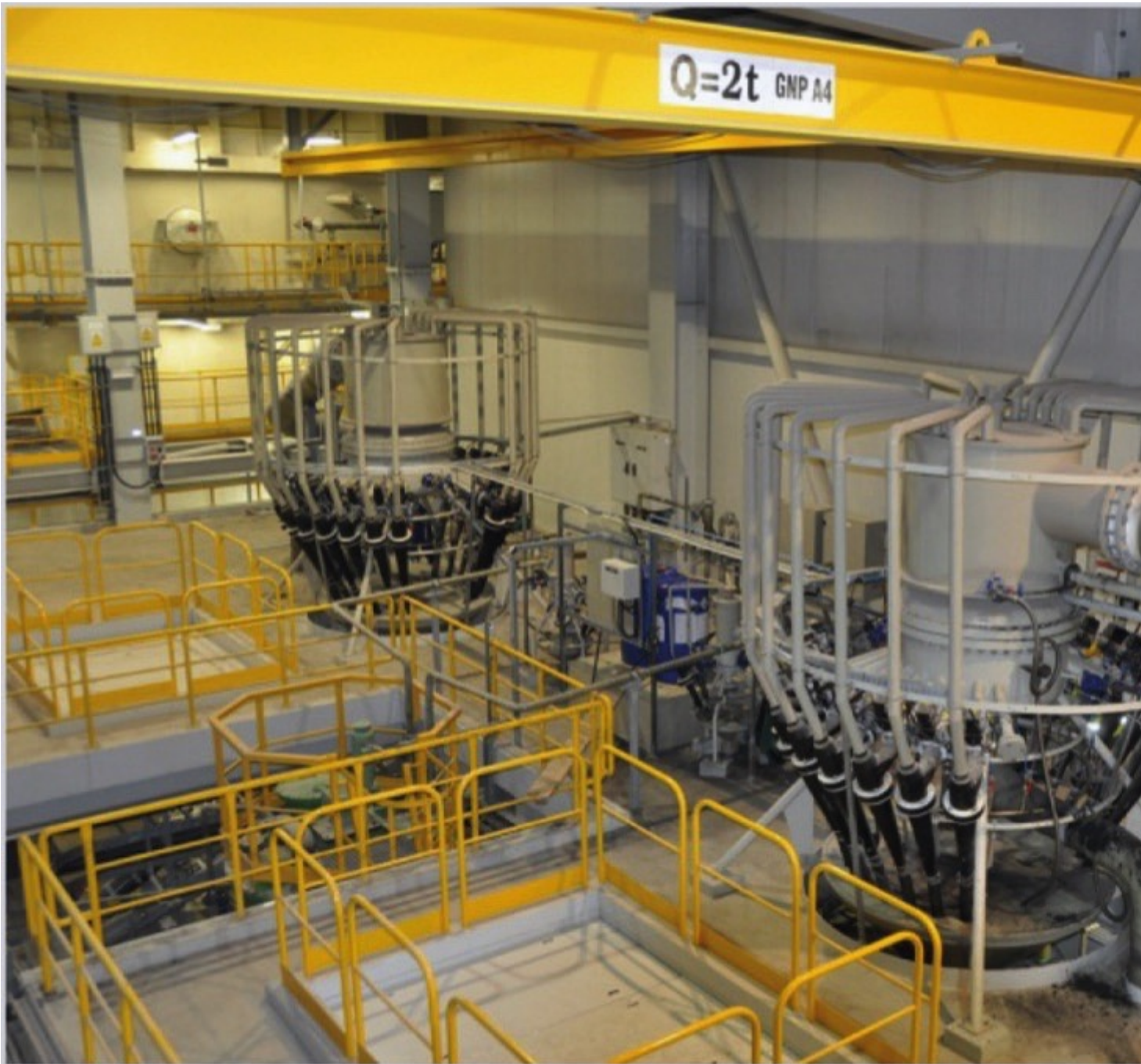
FGD gypsum dewatering system in Belchatov, Poland.