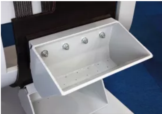
Belt bucket elevators in heavy duty execution.