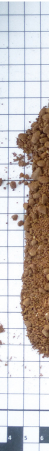
After the C screened material is a clean, salable end product with no clay adhesions.

For the first time, twin-shaft continuous mixers of type DKXC allow regulation of the retention time of the material in the mixer within broad limits. The clay has enough time to mix intensively with the lime and detach from the rock. The intensive movement of material during the mixing process also assists the cleaning process. After screening, the feed material is so clean that it is no longer