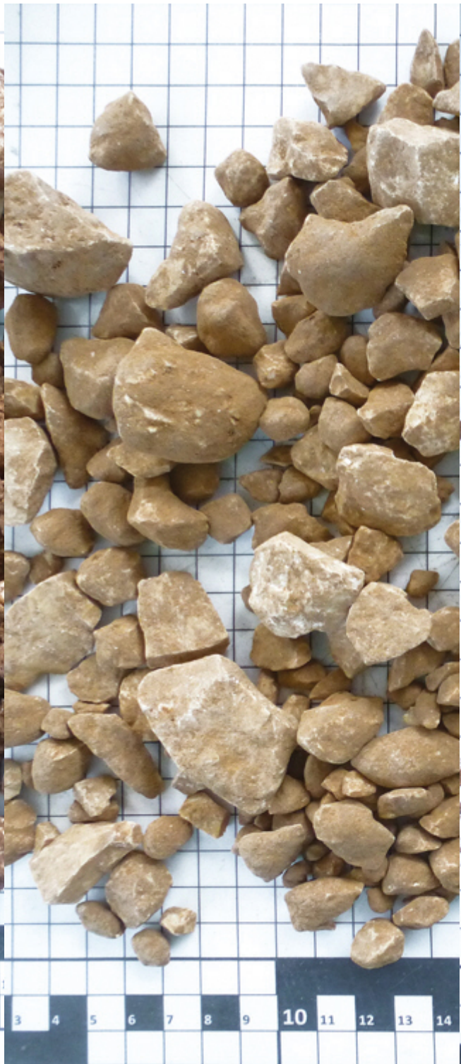
After the Combimix mixing process, screened material > 5 mm is transformed into a clean, salable end product with no clay adhesions.