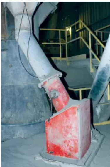
Fig. 4: St. Marys Cement in Canada has been using the Siemens E-300 solids flowmeter for over two decades.

I have been working with flowmeters for eight years and I consider myself to be well versed. I have colleagues who have been working with this technology for 35 years and they consider themselves to be experienced. However, I have yet to meet anyone who considers himself or herself a flowmeter expert!