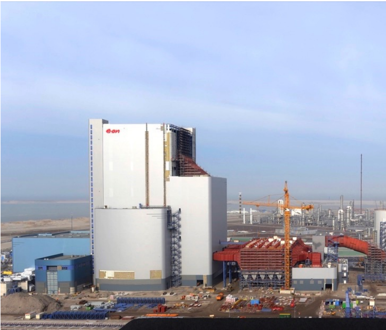
E.ON „MPP3“ coal-fired power plant in Rotterdam-Maasvlakte

The MPP3 is the most modern and biggest hard coal fired power plant with the notable gross power rating of net 1070 MW and a net efficiency of over 46%. E.ON produces steam with very high steam conditions (285 bar, 600 up to 620 °C) by using coal powder. This steam converts to energy by a turbine and a generator. The MPP3 wants to reduce the effects on the environment as much as possible. One point to reach an environmental friendly process is the optimisation of the exhaust-desulphurisation unit. The desulphurisation is made by a wet flue gas cleaning unit controlled by a moisture measurement. This flue gas desulphurisation (FGD) is far more effective than in other traditional coal fired power plants. Beyond the “MPP3” can reach a biomass-combustion up to 30%. Of course the district heating is used from the adjacent companies.