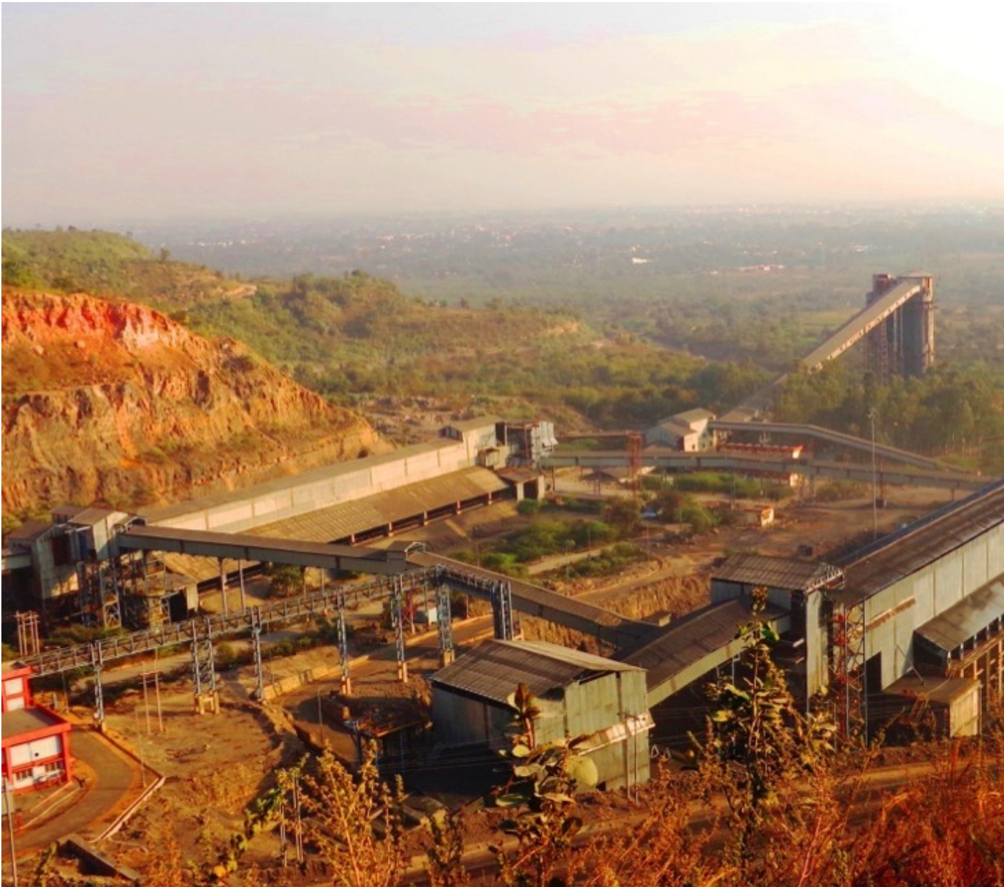
Typical coal loading facility at an Indian coal mine

India is blessed with huge mineral resources particularly coal, iron ore, bauxite, etc. Increased coal production is the urgent need of the hour. Proper assessment of the reserve and the quality of coal is yet to be completed; the available figure indicates an estimated coal reserve of some 300 billion tonnes as of April 2014. The mining industry is facing a big challenge of achieving the targeted increase of coal production due to the difficulty faced in evacuating the mined coal and dispatching it to thermal power plants. The purpose of our present article is to address the issue of improvement in coal evacuation from mines thereby increasing the net coal output of the mine based on experience gathered while executing different projects.