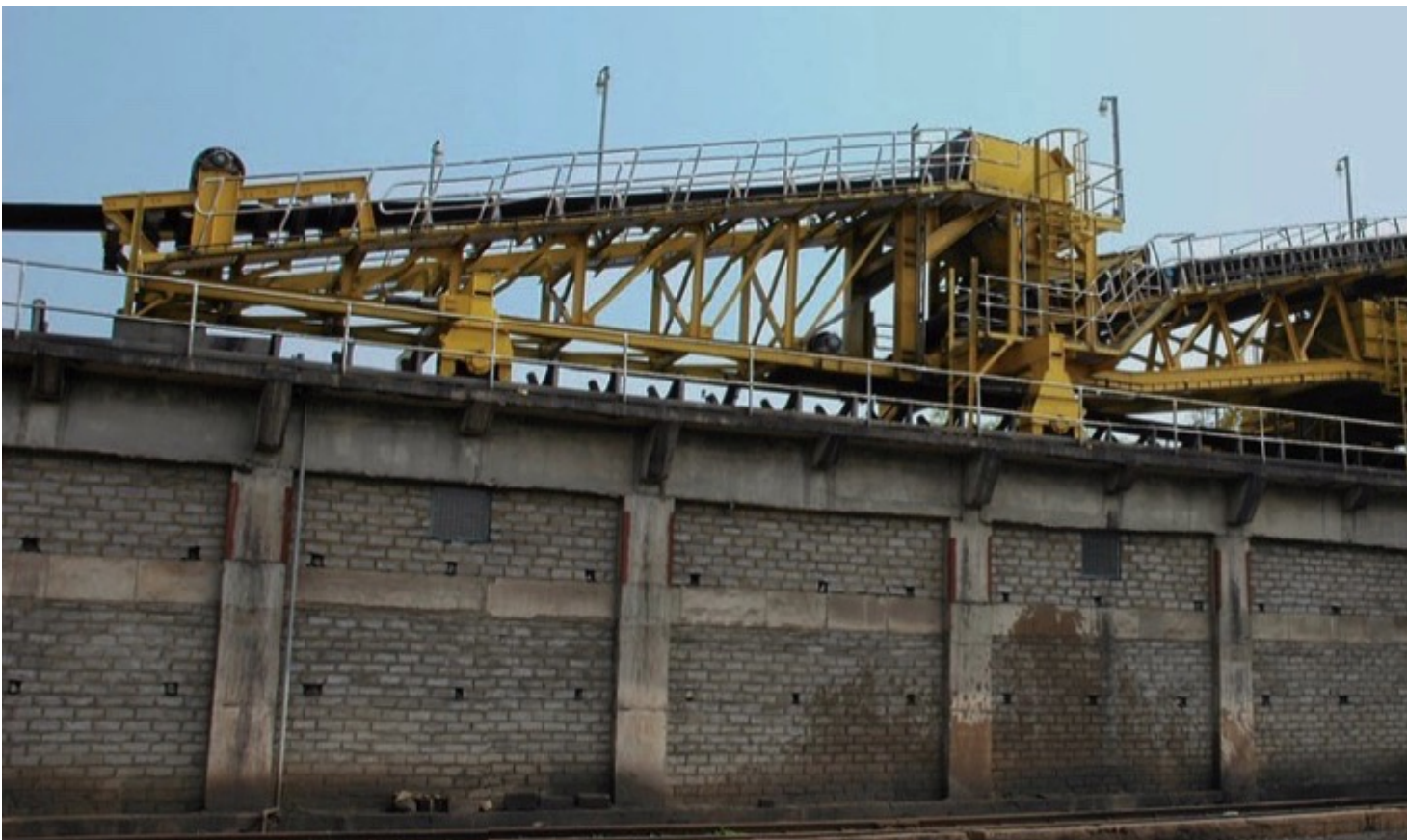
Elevated mobile wagon loader

It is evident that in the whole process of rake turnaround, the major time consuming activity is shunting of empty & loaded wagons which need to be minimized. This in turn will help in large quantum conveying of coal from mines without additional capital expenditure or dedicated rail lines for the movement of