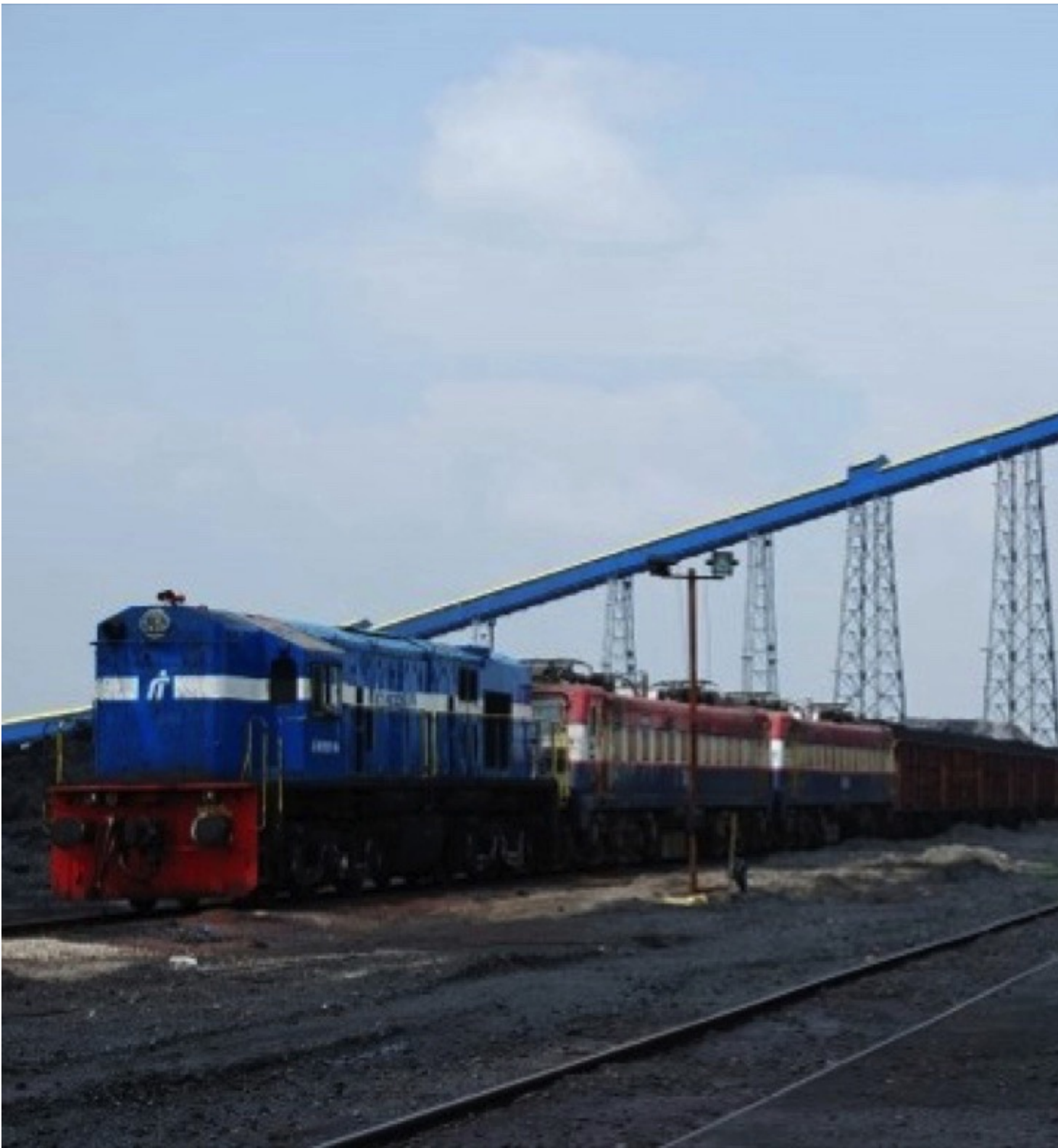
Transfer silo in operation

Some ports are using mobile wagon loading equipment for loading into wagons. This equipment moves over rail which can be either at ground level or at an elevated platform. The mobile equipment (combination of travelling tripper with shuttle head) along with swing chute mechanism loads one wagon after other, which receives feed from the conveyor spanning by the side of railway wagons all along. In this system, entire rake is stationary and equipment is moving. A sketch