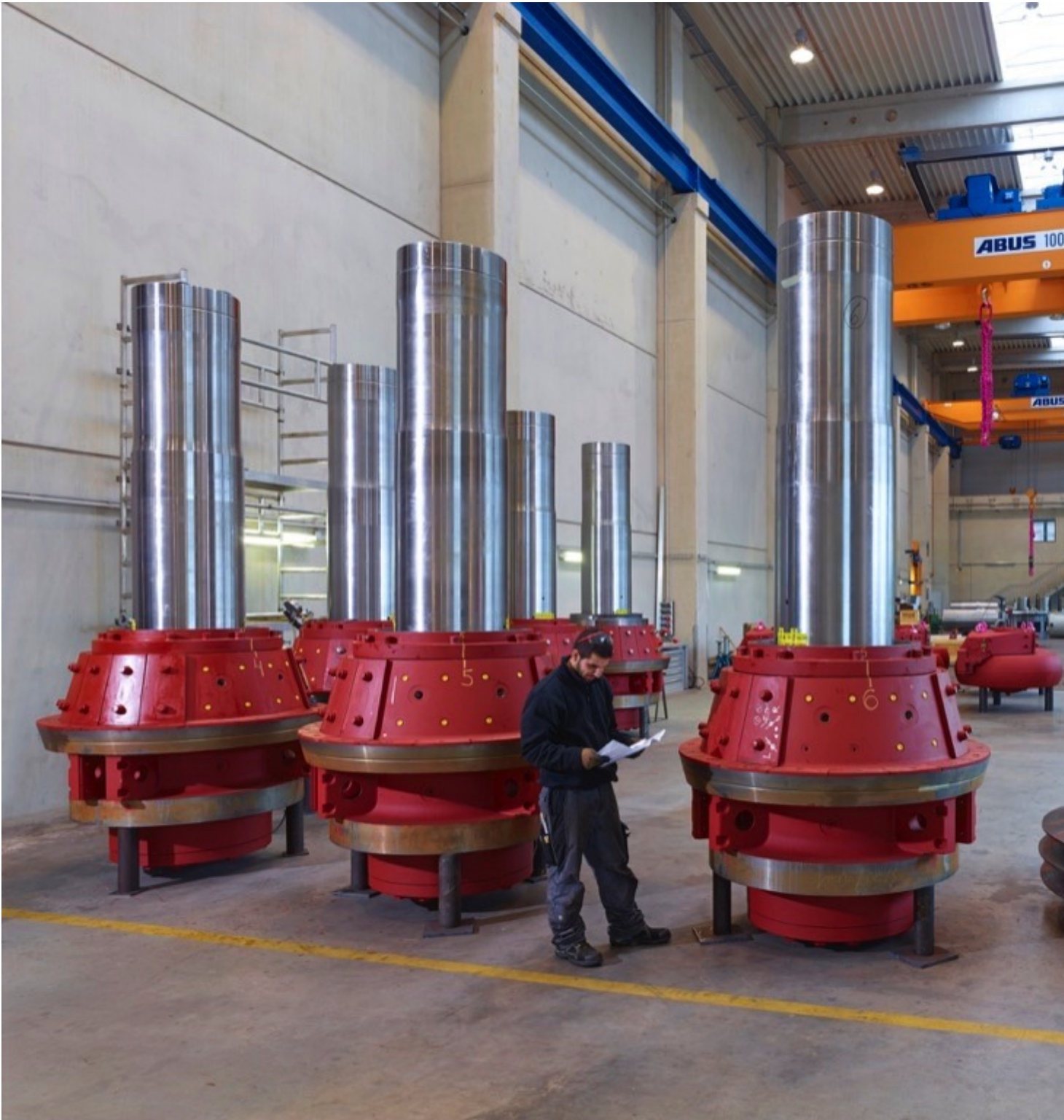
Gebr. Pfeiffer assembly shop in Kaiserslautern, Germany.

The fact that Holcim, as one of the world's largest cement manufacturers, insists on its suppliers creating their documentation with EB was not the main reason why Aucotec actually opted for the company-wide introduction of the software platform. On the one hand, the company's decision-makers looked at the references of other plant engineers while, on the other hand, it was clear that certain standards which they, as a manufacturer with high vertical range of