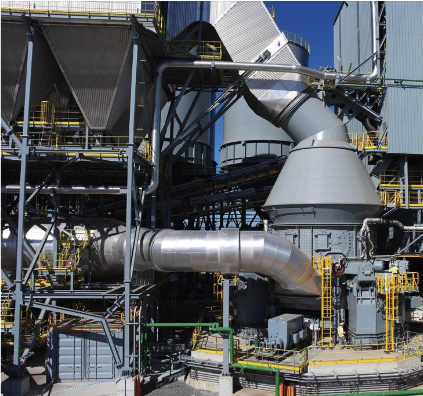
MVR 6000 C-6 – Australias largest cement mill.

Gebrüder Pfeiffer mills have repeatedly achieved such superlatives as the “largest mill in the world”, “largest production output”, or “largest installed capacity”. The world’s second largest cement mill with a capacity of up to 340 tons of OPC (Ordinary Portland Cement) per hour. is currently being constructed for North Africa. The many international orders, especially from countries with a construction boom such as India or China, require highly transparent change management and clear communication with the customer. Amongst others, these were important reasons for the milling experts to look for a new system to