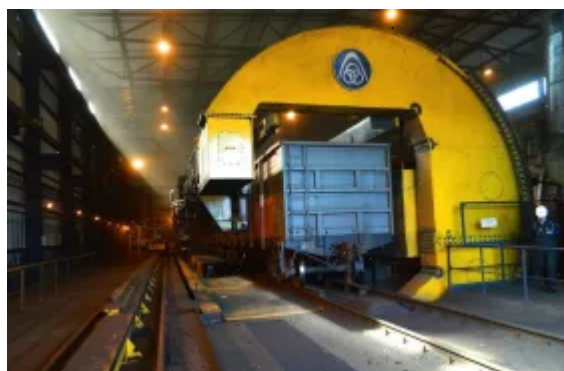
Fig. 1: Tandem tippler working at the Ust Luga coal export terminal, Russia.

Railway transport is one of the most important means of transport for huge amounts of dry bulk solids. Often, train unloading is a bottle neck of such systems. A solution to this problem is presented in the article below.