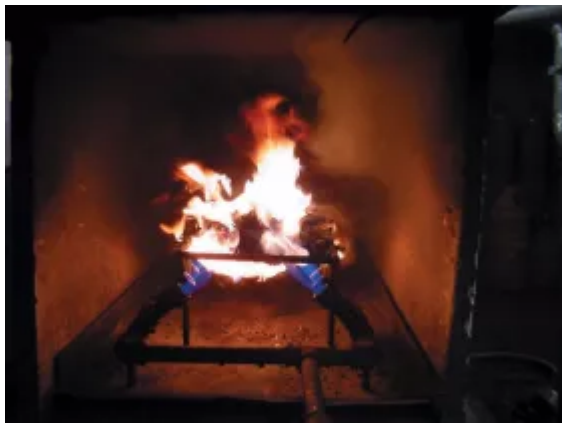
Test method EN 12881 Part 1. Mid Scale method C.

One of the most difficult challenges for users of conveyor belts is establishing the correct level or standard of fire resistance is needed. For the vast majority of belts being used in the open air, Class 2A or 2B would be perfectly adequate. Class 2A demands that the belt is able to pass the ISO 340 test described earlier with the