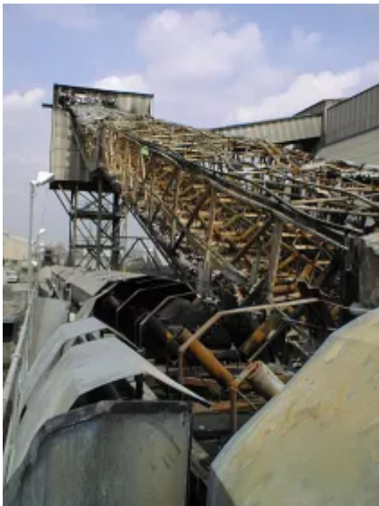
Poor quality fire resistant belt can be expensive!

Is price being put before safety? Or to put it another way, is the operator being lulled into a false sense of security by conveyor belt manufacturers and suppliers?