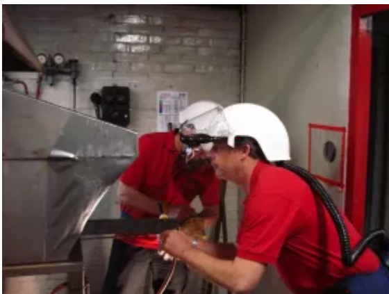
DIN 2218 testing at Dunlop.

Because fire safety is such an important issue there are numerous safety classifications and international standards for which there are many different tests used to measure the self-extinguishing properties of conveyor belts. Rubber belts reinforced by layers of textile fabrics (multi-ply) or steelcord reinforcement are the most commonly used type for transshipment and in general service applications. The basis of most tests for belting used in normal industrial applications is EN/ISO 340. This standard makes the distinction between fire resistance with covers (K) and fire resistance with and without covers (S).