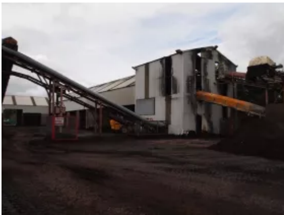
Dunlop BV XS conveyor on the left stopped the spread of fire.

EN 12882 is the standard for safety requirements for conveyor belts for general-purpose use (not underground). The most basic electrical and flammability safety requirement is EN 12882 Category 1. For environments where coal dust, gas, fertilizer, grain or other potentially combustible materials are involved, it is essential that the conveyor belt cannot create static electricity that could ignite the atmosphere. Belts need to be able to allow static electricity to pass through the metal frame of the conveyor structure down to earth rather than allow static to build up. At Dunlop we decided some time ago that the safest approach was for all of our belts to be anti-static and conform to EN/ISO 284 international