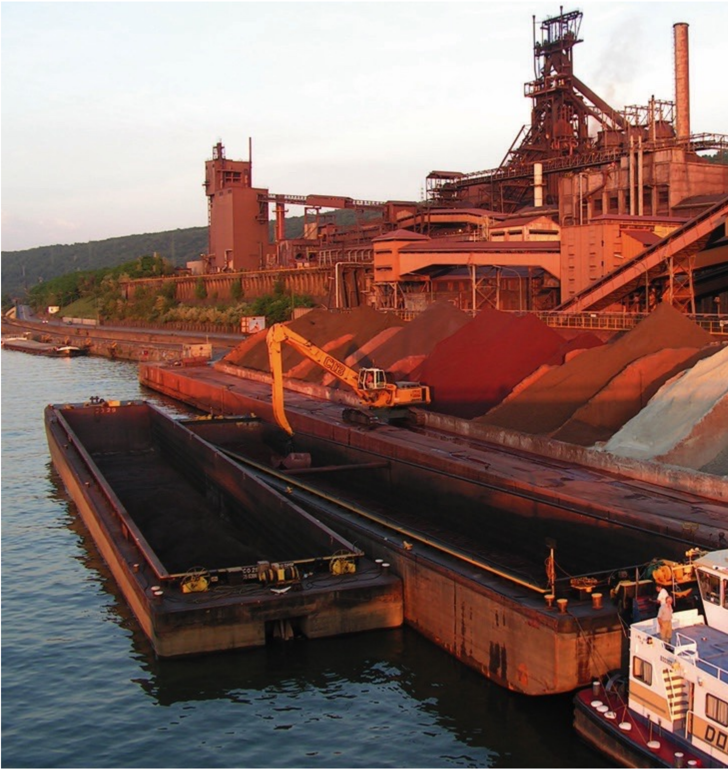
Fig. 1: Steel production involves a vast amount of materials handling.

The volume of raw materials and intermediate products handled in an integrated iron and steel plant is enormously high. Handling, storage and transportation of these materials in the preliminary stages of iron and steel production are a cumbersome task due to large volumes of different materials and their aggressive natures. The equipments in-volved in material handling such as chutes, hoppers, bins, vibrators, feeders, and bunkers are lined through their working surfaces for