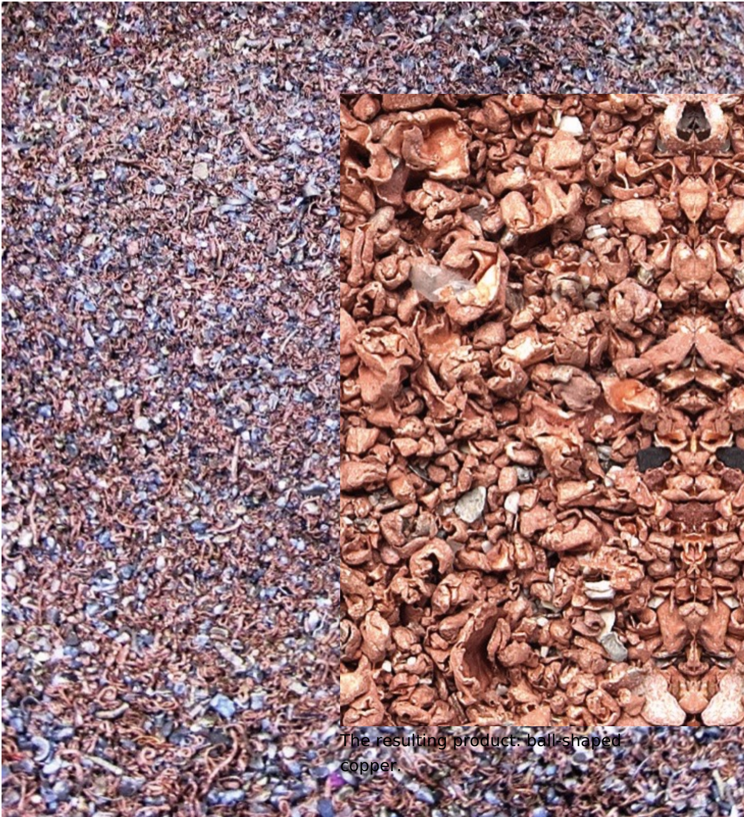
The resulting product: ball-shaped copper.

The result: non-magnetic metals with a grain size of 0 - 3 mm.