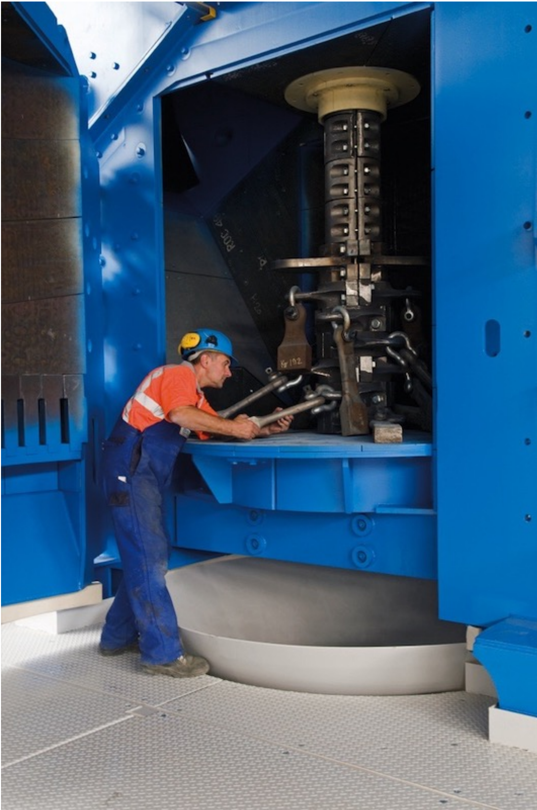
Internal view of the BHS rotor shredder.

After two years of production in the existing treatment plant with a BHS rotor centrifugal crusher of type RSMX, it has been proven that dry treatment of the slags is significantly less problematic and more economical than wet treatment. This also becomes apparent in comparison with other steel mills which operate plants with wet treatment. The customer's laboratory discovered that the treated and returned metallic material with a grain size of less than 22.4 mm has on