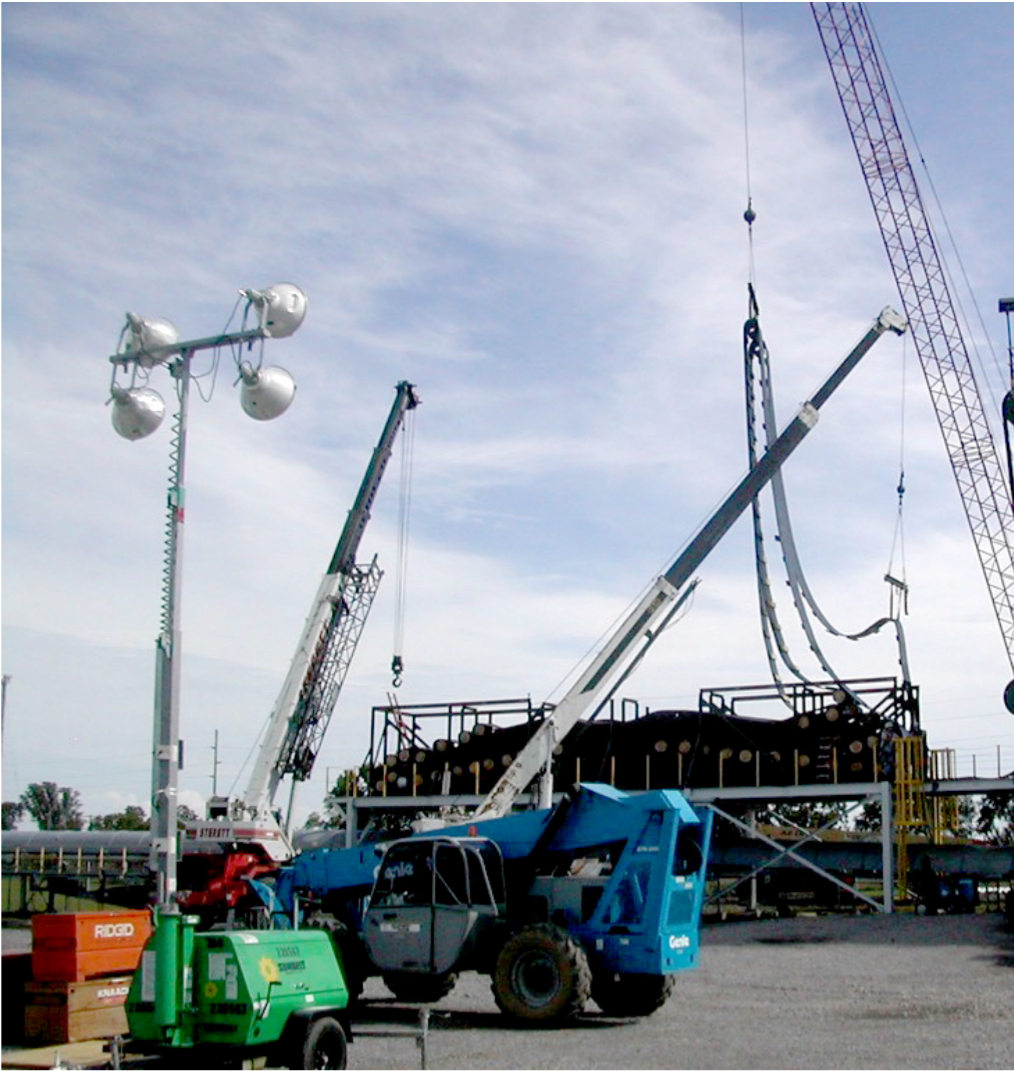
The White County Coal (WCC) Mine in Carmi, Illinois, USA, today operates the world's largest Pocketlift installation. After nine years, the company has replaced the conveyor belt once.