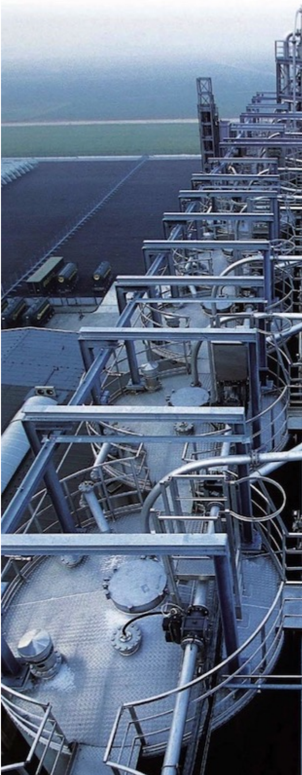
Fig. 3: Each plant is subject to specific requirements and is individually designed and built.

The quality of plant engineering has significantly improved since the software has been introduced. Thanks to the integrated database and the software's object-oriented approach, the engineering process now is far more transparent. This has resulted in an improved exchange of information between the various technical