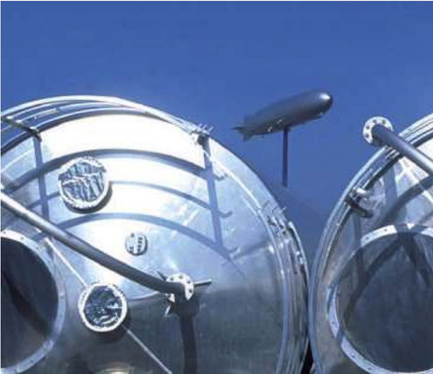
Fig. 2: Innovative bulk solids technology for complete plants, systems or components.

The first step was to specify what exactly was required from the software solution. This included software functionalities, the ERP (Enterprise Resource Planning) system interface, integration into current IT systems, market acceptance of the software, development potential, costs, and the overall usability of the software. In particular, great importance was attached to global usability of the software, as engineering collaboration across the globe had become increasingly important – specifically between the headquarters in Friedrichshafen, Germany, and the other branches – in China, India, Brazil, and the USA, among others.