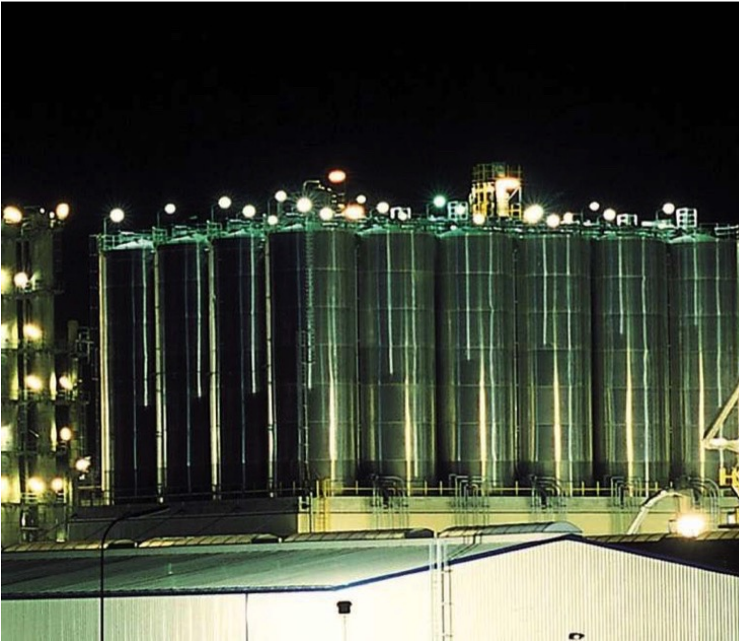
Fig. 1: Zeppelin Systems is one of the world's leaders in the engineering and construction of silo and logistic centers for bulk solids.

Zeppelin Systems has a long history, stretching back over the past century to when Graf von Zeppelin first developed his legendary airships. After Zeppelin had stopped producing airships, they went on and founded numerous companies which continue to be successful in various markets in today's industry. One of these companies is Zeppelin Systems, a leading manufacturer of plants for storing, conveying, dosing, weighing, cleaning and blending premium bulk solids. Zeppelin Systems design and manufacture plant and conveyor components for the chemical, plastics, food, and pharmaceutical industries, as well as for the manufacturing of rubber and tires. At the same time, the company is one of the