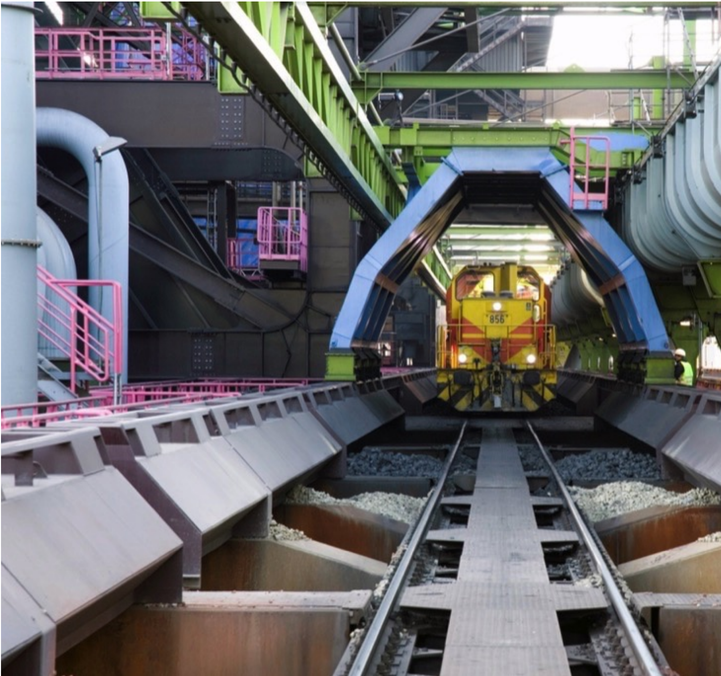
Fig. 1: The mobile high-performance de-dusting facility ensures minimum dust emissions during railcar unloading at the Thyssenkrupp Steel site in Duisburg-Hamborn, Germany

Constantly rising environmental protection requirements to reduce fine dust emissions on bulk cargo trans-shipment set new standards to integrated steel mill operators. A worldwide unique mobile high-performance dust removal facility for bulk cargo unloading jointly developed by Uhde Services (ed.: now thyssenkrupp Industrial Services) and ThyssenKrupp Steel Europe has been in operation since