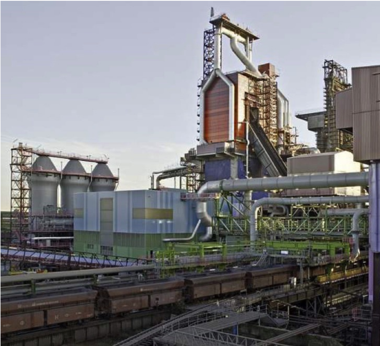
Fig. 2: Blast furnace no. 8 in Duisburg-Hamborn

The blast furnaces no. 8 and no. 9 at the ThyssenKrupp Steel Europe site in Duisburg-Hamborn, Germany, receive their required raw materials supplies through an elevated railway bunker unit which consists of 64 day-capacity bunkers, see Figs. 2 and 3.