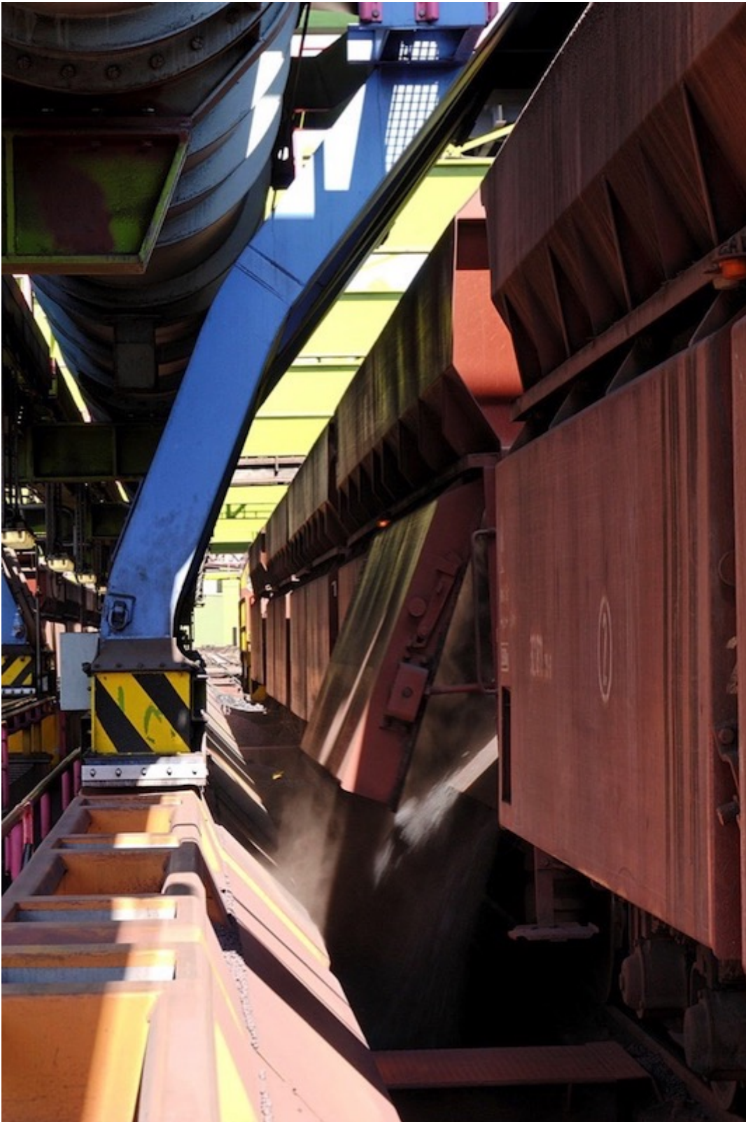
Fig. 6: Lateral suction at the wagon

The seal belt lifting car forms the connecting link between the stationary hoods and the central dust collecting duct which is arranged in parallel to the relevant railway track. Prior to unloading the wagon, the unit driver calls on the central filter station via radio remote control to supply the necessary suction capacity. The mobile dust capture system can also be designed to work in fully automatic mode. A sophisticated monitoring system takes account of all safety aspects.