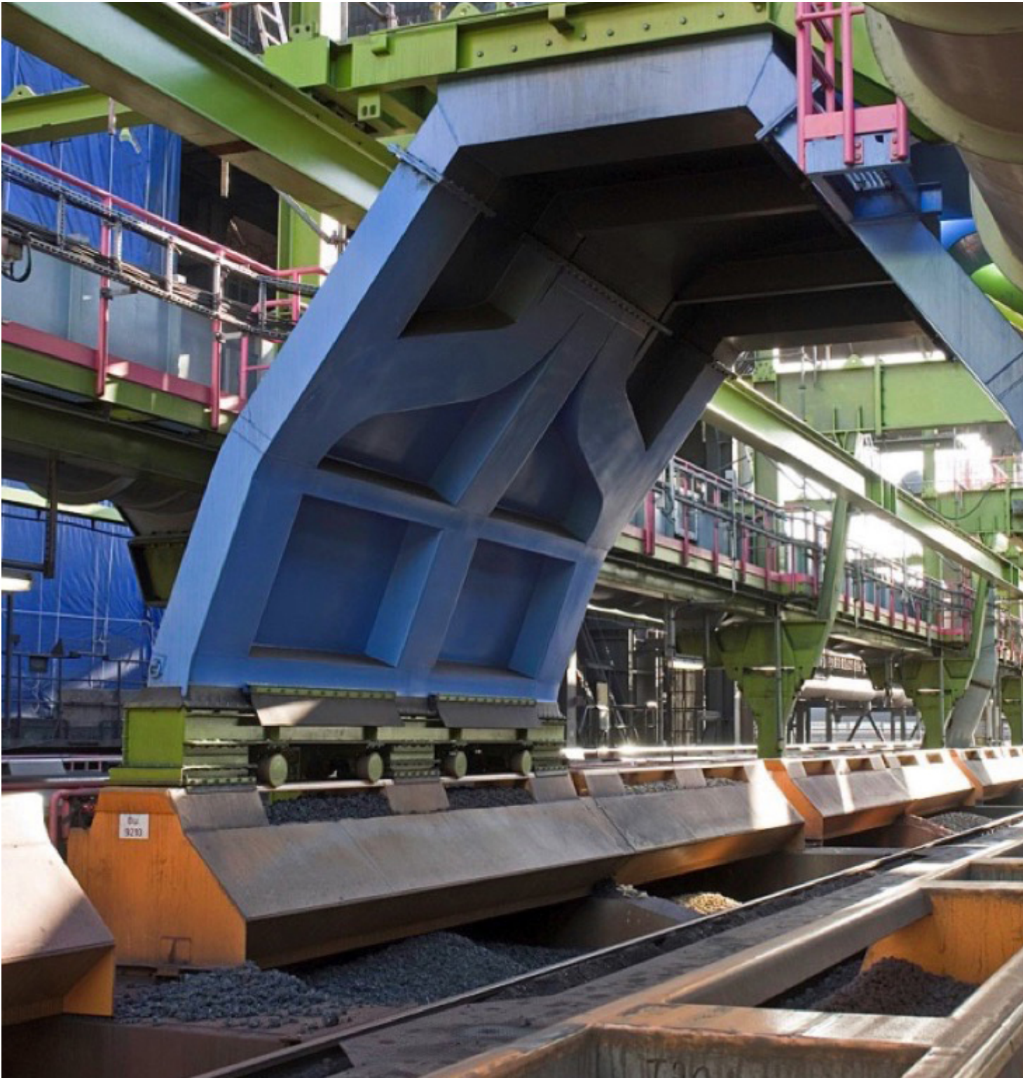
Fig. 5: Fabrication and installation of the plant unit

The wagon is enclosed by the suction car, thus providing additional protection from leakage of residual emissions. The seal belt lifting car diverts the rubber seal belt of the dust collecting duct, thus establishing a constant connection to the dust collecting duct which leads to the central filter station.