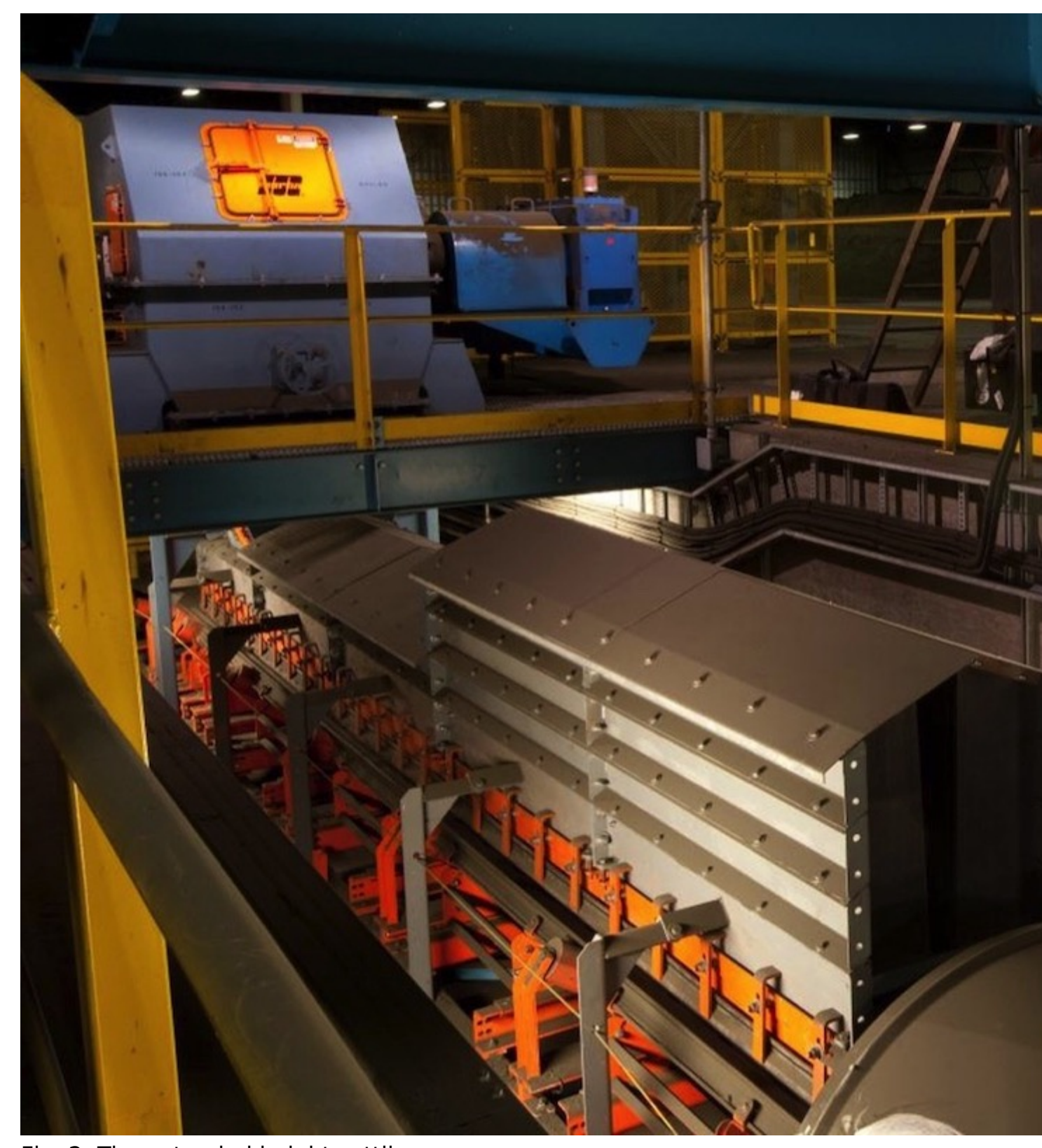
Fig. 2: The extended height settling zone from Martin Engineering is designed to decrease air velocity and increase settling time.

Load zones and discharge points are prime sources for the creation and release of airborne dust. The amount of dust created in a transfer point depends on a number of factors, including the nature of the material and the height of the drop