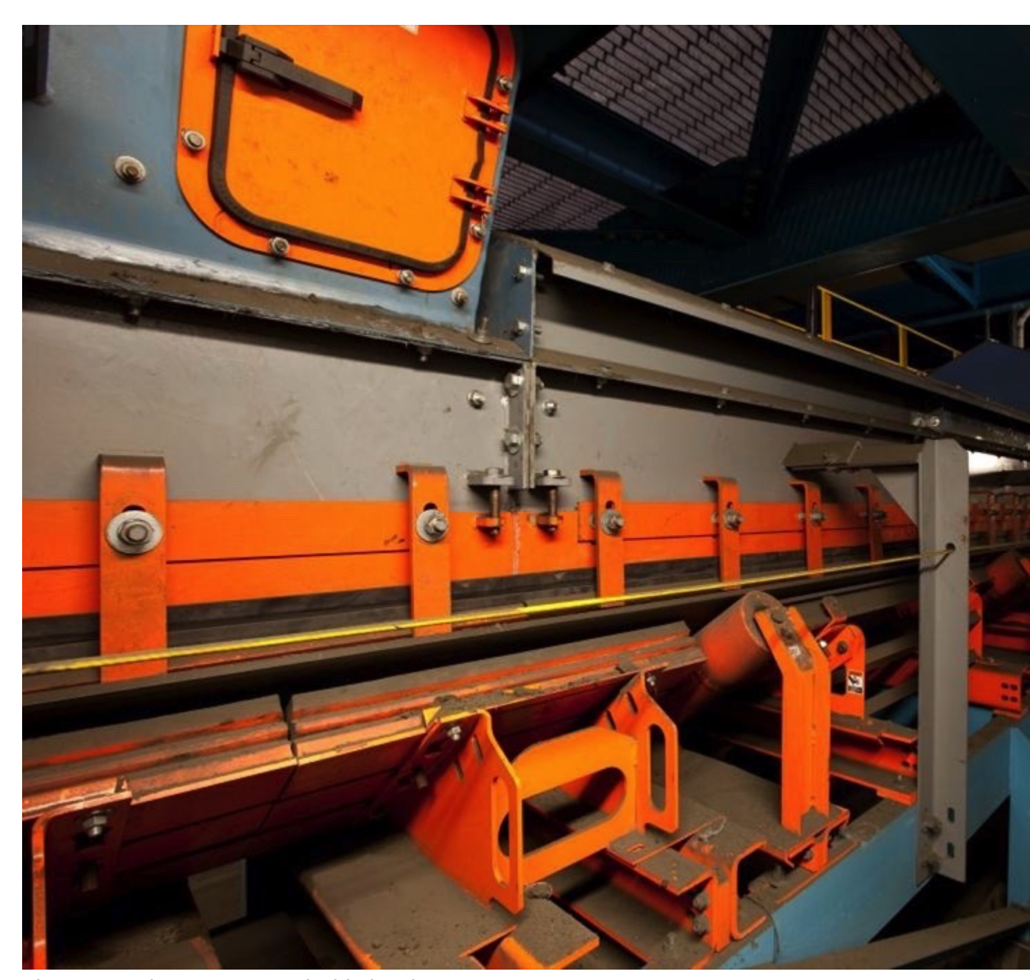
Fig. 3: Martin® ApronSeal Skirting is a dual-sealing system, with a primary seal clamped to the steel skirtboard and an "outrigger" strip to capture