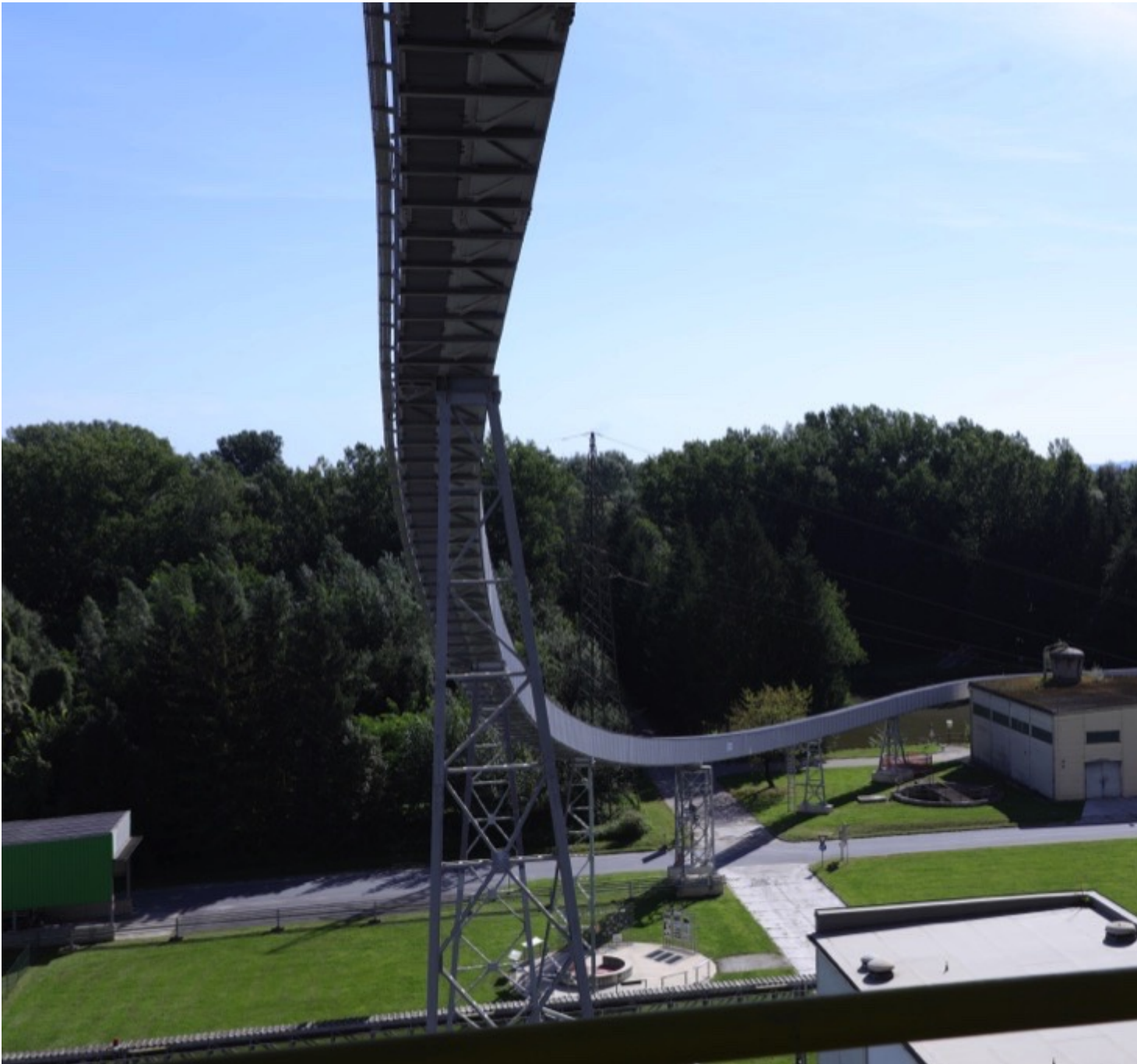
Fig. 7: U-shape Conveyor are easy to integrate and are also suitable for horizontal and vertical curves.

The U-shape Conveyor transfers the material to a double discharge screw conveyor of the BG OptiLock constructions series. The airlock of this system solution protects the pyroprocess from the infiltrated air from outside, which can arise in the combustion process. The BG OptiLock is also equipped with weighing cells. Therefore, the owner always has an overview of the actual material load. The discharge screw conveyor transfers the bulk material continuously on a screw conveyor, which feeds the calciner. As the material can catch fire, the system provider has designed all supplied systems according to the ATEX directive for the