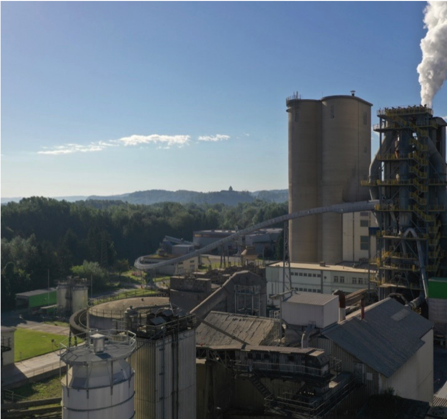
Fig. 2: The BEUMER Group developed a customised complete solution.