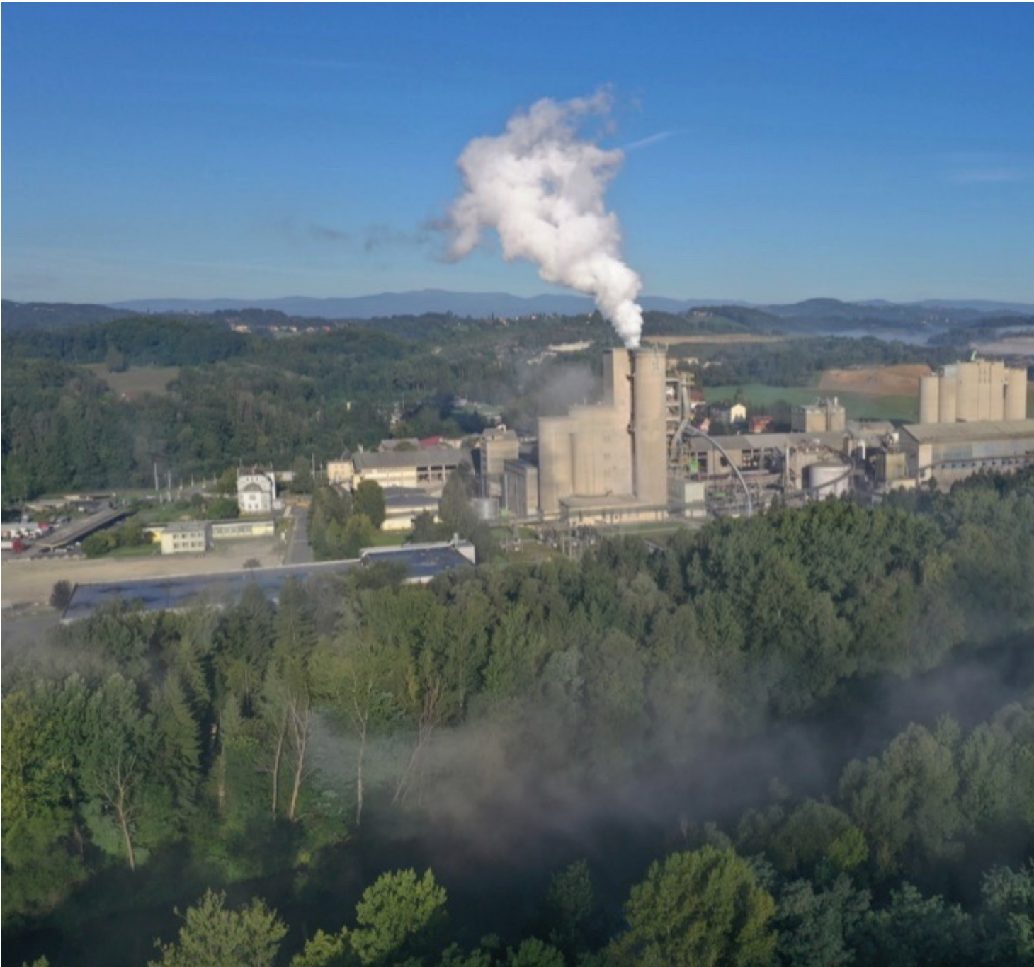
Fig. 1: For economical and sustainable operation, Lafarge Zementwerke GmbH in the Austrian Retznei plant relies on alternative fuels and raw materials to fire the new calciner.

In Austrian Styria, the small village of Retznei lies directly on the Mur river. Many inhabitants in this area live from growing grapes, fruit, pumpkins and beans. However, the most important employer does not originate from agriculture but from cement production: Lafarge Zementwerke GmbH, a company of LafargeHolcim headquartered in Rapperswil-Jona in Switzerland. "Cement has