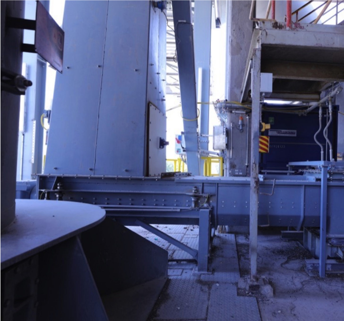
Fig. 5: The double discharge screw conveyors of the BG OptiLock series: The air-lock principle protects the material from the false air from outside

special housing, which protects the environment from dust escape and the material from environmental stress. "This station enables to unload up to 150 cubic metres of fuel per hour," says the BEUMER expert. The material, which is delivered by trucks, falls from the unloading station into the BG OptiFeed screw weigh feeder in a container of 20 cubic metres. A conveying system transports further combustible material of the waste disposal service provider Geocycle to a second BG OptiFeed in a container of 50 cubic meters.