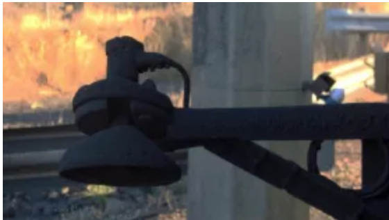
Fig. 4: Radar sensor with parabolic antenna for monitoring a coal unloading station.

One great advantage of radar technology is that microwaves propagate without being affected by dust. Reliable measurement is therefore possible even under conditions of extreme dust generation.