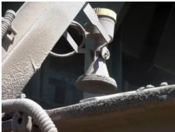
Fig. 7: Measurement of crusher filling level in a copper mine by radar.

Using standard sensors and adapting them to the process via simple mechanical components keeps investment costs within reasonable limits. In many cases there is no need for costly, specially designed parts or setups.