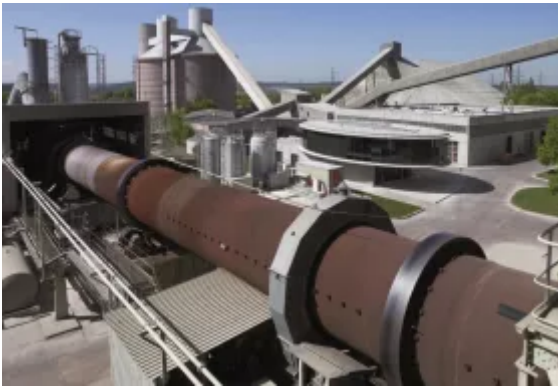
Fig. 1: Cement production is one of the application areas where equipment has to withstand extremely high temperatures.

wide variety of applications. Often used are standard devices that differ only with respect to their antenna system.