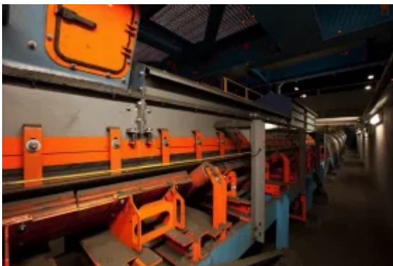
Fig. 3: Martin® ApronSeal™ Skirting is a dual-sealing system, with a primary seal clamped to the steel skirtboard and an “outrigger” strip to capture fines and dust.